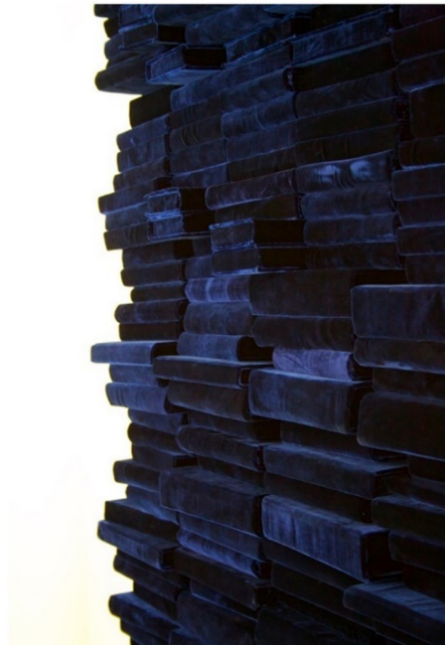
Figure 1. Velvet Books.

primary objects of Nazi book burning to ensure the erasure of Jewish culture and primacy of Nazism as the true religion ( Confino 2014 ).