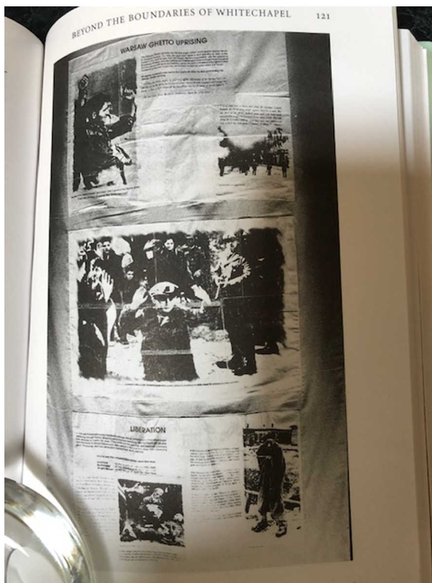
Figure 3. Shoah.