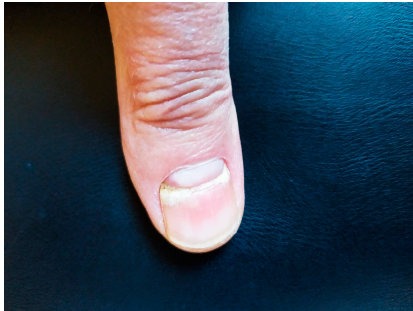
Figure 1. Transverse grooving (Beau's line) of the second fingernail.

Beau's lines (Figures 1 and 2) are transverse grooves in the nail plate that result from transient interruption of the growth of the proximal nail matrix [8]. Beau's lines have been associated with severe cutaneous inflammatory diseases such as Steven–Johnson syndrome or Kawasaki disease, as well as with malnutrition or exposure to certain medications. In the context of COVID-19, however, little is known [6]. In rare instances, various nail disorders have also been associated with vaccines for COVID-19.