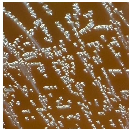
Figure 2. P. bivia colonies grown on a blood agar plate after 72 h. Colonies are shiny and gray in color.