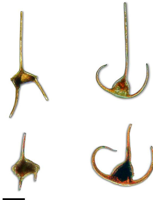
Figure 1. Illustration of infraspecific morphological variations in Neoceratium species. Slender variety depressum (upper left) and robust variety candelabrum (bottom left) in N. candelabrum . Slender variety gracilentum (upper right) and robust variety arietinum (bottom left) in N. arietinum . Bar scale 50 \mu m. Lugol-fixed cells.