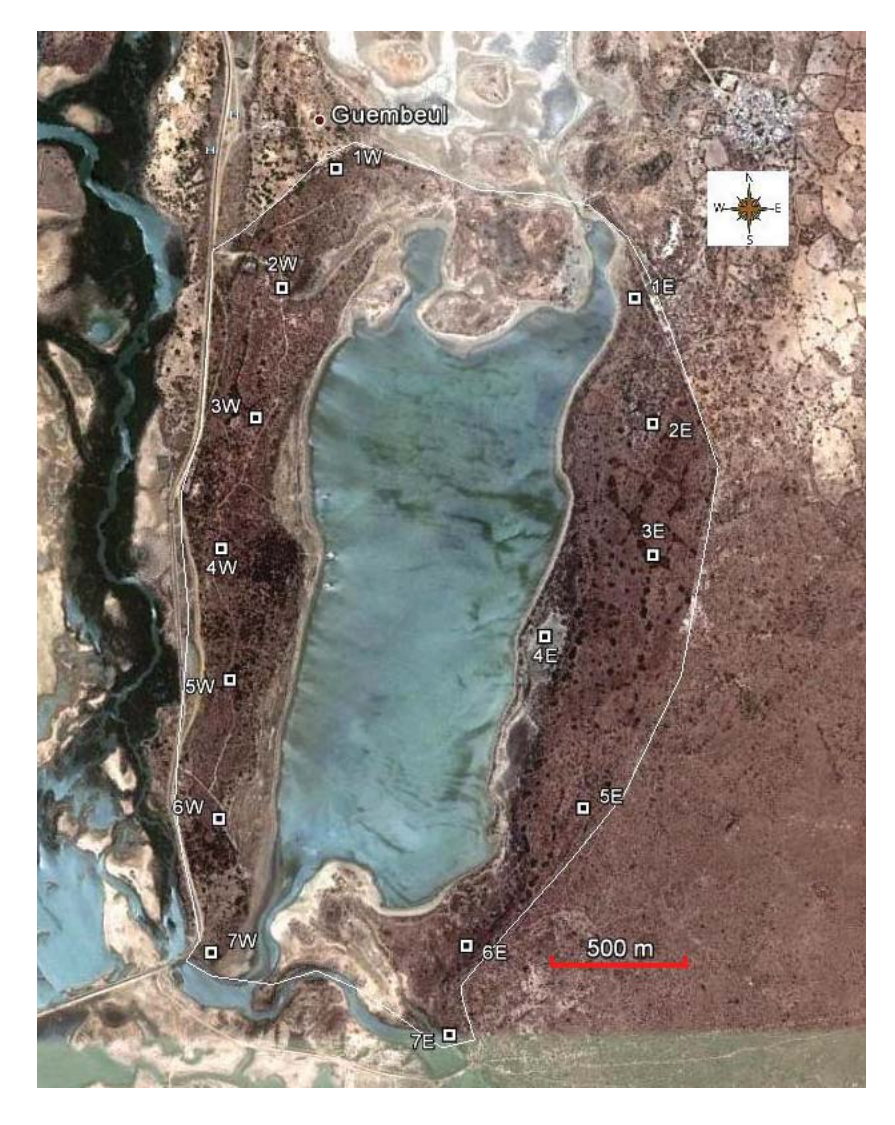
Figure 1. Map of the Reserve of Fauna of Guembeul showing plots where habitat structure has been sampled ( 15^{\circ}55'N ; 16^{\circ}28'W ). The central lagoon divides the Reserve into a western part and an eastern part, each of them containing seven sampling plots (1W-7W; 1E-7E). The white line around denotes a perimetral fence.

Reintroduced Mohor gazelles were part of the species EEP (European Endangered Species Programme), and were identified with the following studbook numbers [13]: ND176, ND229 (males), ND39, ND114, ND172, ND191, ND241, ND247 (females). Female ND247 died during transport. Upon arrival, a breeding group was placed in a 400-m<sup>2</sup> pen (male ND176 and all of the females), and the remaining male (ND229) was kept alone in a 100-m<sup>2</sup> pen. Details of the evolution of the stock released until 1992 can be found in [14].