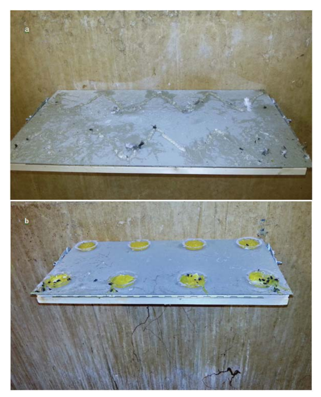
Figure 3. Appearance of the tactile gel ( a ) and the optical gel ( b ) after 23 days of application. Due to the adhesive effect numerous insects, feathers, dust and feces became stuck in the gels. The gluey optical gel got stuck on the wall underneath the experimental shelf when the pigeons stepped into the repellent and flew off pulling long adhesive strings. These remains were extremely difficult to remove.

As to the animal welfare point of view we could observe several pigeons stepping into the gels, either directly when landing onto the experimental shelves or subsequently after landing next to the shelves. Already after a short period of time, both gels looked rather unesthetic and messy due to a variety of insects, feathers and dirt that become stuck in the repellents either directly or in the remains on the shelves (Figure 3).