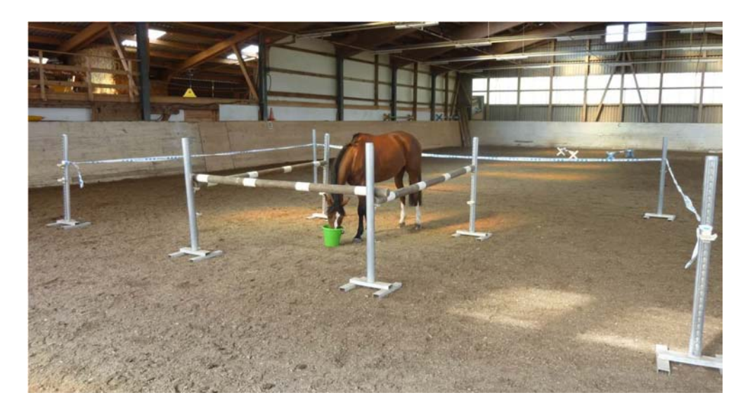
Figure 2. Horse feeding from the rewarded bucket after successfully completing the detour task.