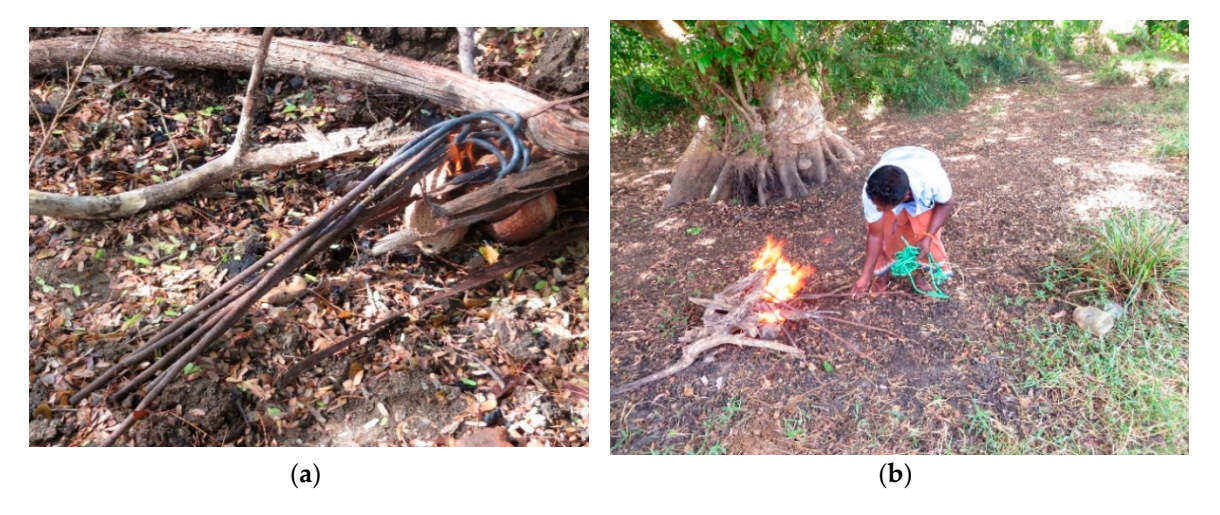
Figure 2. Fire-heated irons used for branding on Farm 1 (a) and Farm 4 (b).