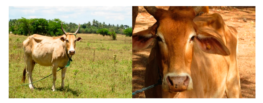
Figure 5. Farmers reported that efforts to introduce ear tags in the Eastern Province are impeded by poor tag retention in extensive systems.

The farmers believed ear tags were poorly designed for extensive operations; in addition to hindering identification from a distance, the farmers reported that ear tags were easily dislodged (Figure 5).