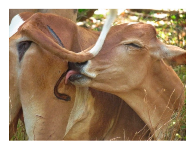
Figure 4. Animals were observed licking the brand immediately after the procedure.

reviewed previously [19]. There are no established methods for treating long-term pain in cattle. In the current study, three of the farmers applied coconut or neem oil topically to the wound. Two of these farmers added turmeric for its perceived healing and anti-bacterial benefits. Coconut oil, neem oil, and curcumin, the active compound in turmeric, have been shown to hasten wound healing in rats [28–30]; however, in these studies the treatment was applied at multiple timepoints, and it is unclear whether a one-time application would have any benefit. Moreover, we observed wound-licking immediately after the procedure, which could limit the efficacy of topical preparations (Figure 4). Neither a cooling gel, applied once or twice after branding, nor a single injection of flunixin meglumine, improved healing or pain outcomes [6,7]. Due to a lack of feasible, cost-effective, and long-lasting treatments, the only viable approach to pain management currently is a preventive one, in which more welfare-friendly alternatives to branding are employed.