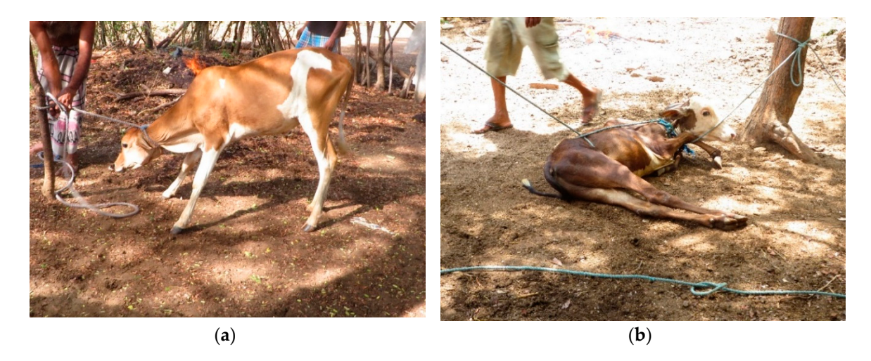
Figure 1. In preparation for branding, animals were roped around the neck (a) and laid on the ground (b).

brands took at least 1 min to apply, substantially longer than the 1–5 s reported for stamp brands in horses and cattle [7,14,15].