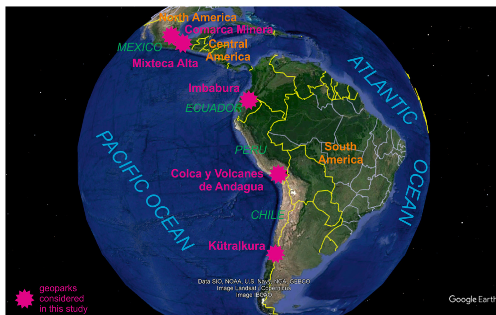
Figure 1. Geographical location of the considered geoparks. Base image was generated with Google Earth Pro engine.

If a given geopark becomes the object of international research, the outcomes of the latter are normally published in international (not necessary English-language) journal(s) indexed by major bibliographical databases. Therefore, the examination of the publishing activity permits judgments of the scientific importance of global geoparks. The validity of bibliographical surveys in the studies of geoheritage, geotourism, and geoparks has already been proven [13,19,20,56]. For the purposes of the present study, the on-line bibliographical database “Scopus” was used to collect journal articles that mention the selected geoparks in titles, abstracts, and/or key words. This database boasts a significant