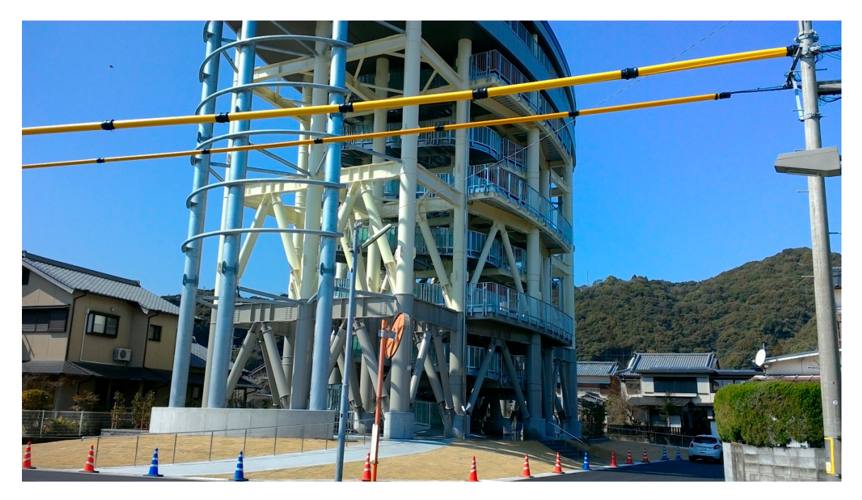
Figure 3. 22-metre high tsunami evacuation tower in Hamamachi Ward in Kuroshio Town.

The key outcomes of the series of discussions undertaken through the staff-in-charge system included the investment in structural hard measures. The rearrangement and construction of 250 tsunami evacuation routes, evacuation signs, lighting systems and six tsunami evacuation towers were mostly completed by 2017 [31]. Kochi Prefecture chose evacuation towers, rather than seawalls widely seen in the Tohoku coastal region. This point will be elaborated on further in the Discussion section in relation to 'Seaside Gallery'. Figure 3 is the sixth tower, which had just been completed when the author visited Hamamachi Ward. If the Nankai Trough Earthquake occurs, the first 18-metre wave will hit the ward within 19 minutes, but their nearest high-ground is 25 minutes away. The community therefore requested the construction of the 22-metre tower, which is the tallest tsunami evacuation tower in Japan [32]. Many residents expressed relief once the towers were built (Informal).