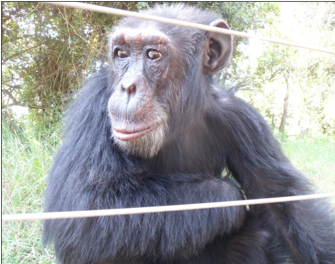
Figure 2. (a) A cage similar to the one that Poco lived in at the service station in Burundi until he was rescued in 1989; (b) Poco spends most of his time walking upright and bipedally as a result of the damage incurred to his back from living in such a tiny cage.