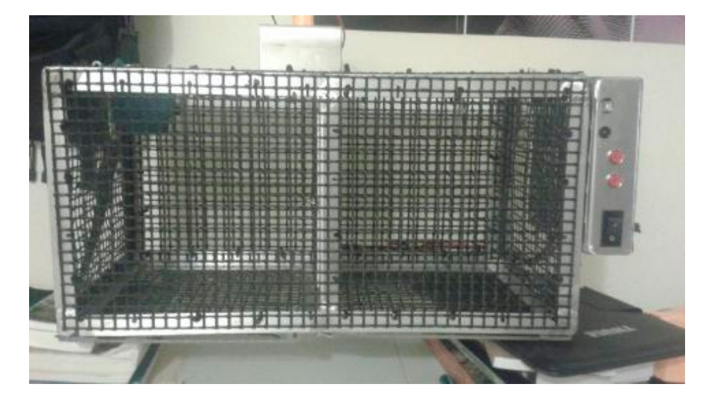
Figure 1. Apparatus in which bats were placed. The apparatus contained two compartments connected by an inner mesh door. Compartment A, on the left, contains the sensor in the top left corner. The bottom of each compartment contained a Lexan door, which, upon activation, opened to release the bat. The right control panel consisted of a USB port, two push buttons that, when pressed, released a trap door, and on/off switch. Resting on top of the apparatus was a DeWalt 18V XRP battery, which acted as the power source.