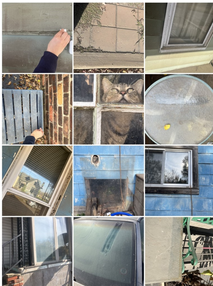
Figure S3. Photos showing examples of wipe sampling locations. 1 st row: Porch, tile and window sampling along Dearborn Street. 2 nd row: plastic table, window and glass table in Kaier Street area. 3 rd row: window, plexiglass sheet and back yard window on Graham Street area. 4 th row: window, car windshield and glass plate in Graham Street area.

The figures suggest that relative to ambient TSP, soils and dusts are enriched in Cu and Zn (and Pb and Mn for the source area) compared to the other elements (e.g., Fe, Mn, Cr). This analysis has limitations: the TSP metals were collected at a different site; only a subset of metals are included in the TSP measurements; only 2021 data are used for the TSP. Similar analyses for PM 10 and PM 2.5 show considerably more scatter, indicating greater variation between metal compositions in dusts/soils and ambient air for the smaller size fraction. This is consistent with soils and dusts reflecting primarily dust fall of larger particles.