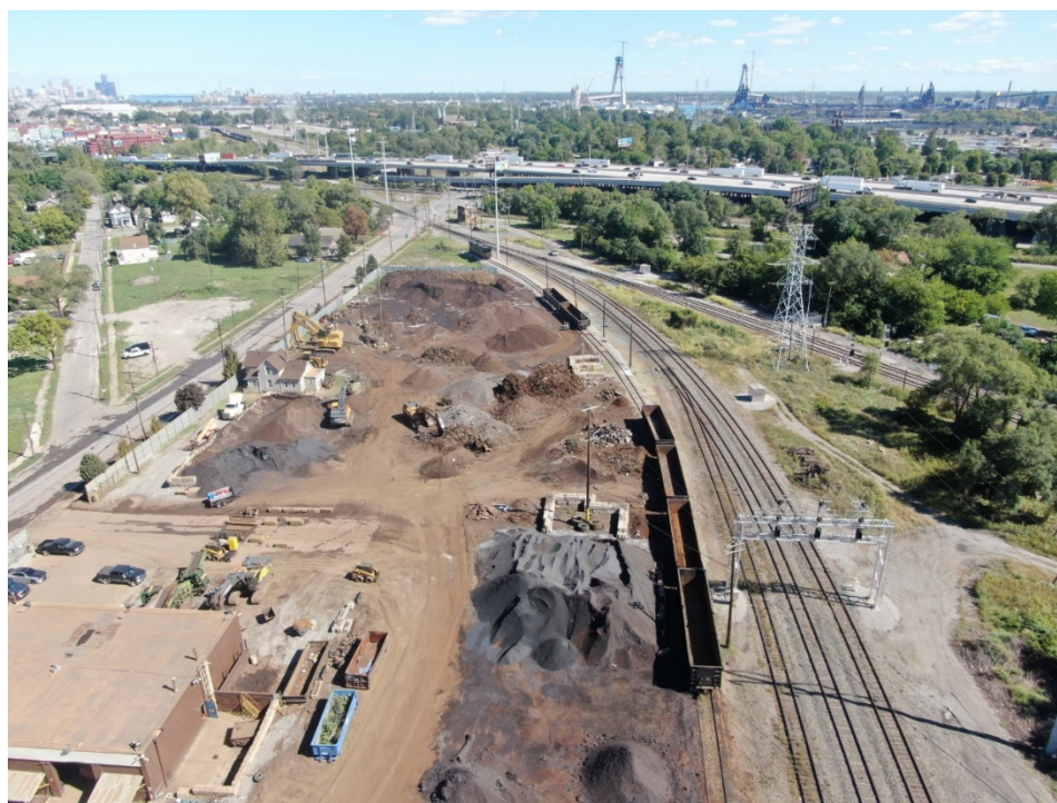
Figure S2. Photos showing arial view of facility. Top: Looking west. Bottom: Looking East.