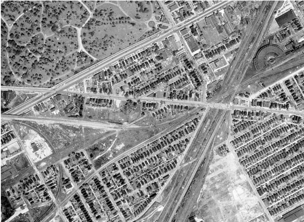
Figure S1. 1949 aerial view of processor. Note homes line south side of Dearborn street and only the western portion of the property appears to be industrial.