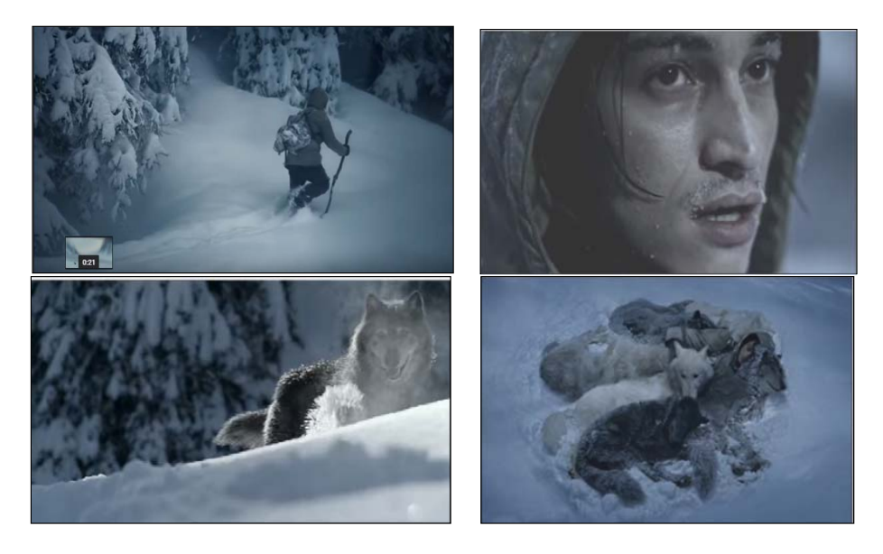
Figure 3. Screenshot TV commercial SL.