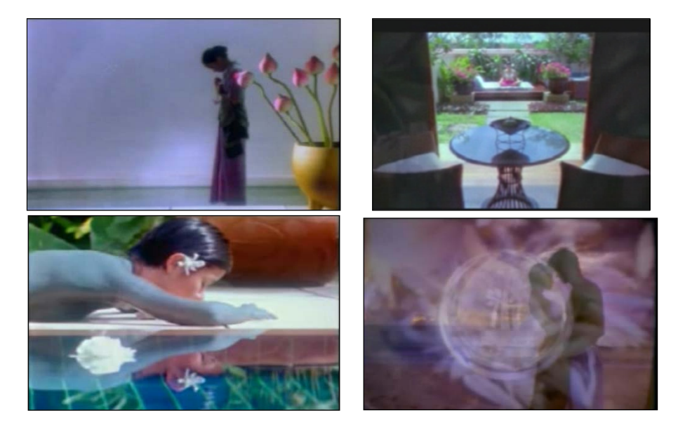
Figure 4. Screenshot TV commercial BT.

To evaluate which archetype people saw in the ads a test similar to Characterlab.com's test was designed which in turn is based on the Pearson-Marr Archetype Indicator [51]. After viewing the ads the participants had to rank attributes that described the ads. The survey was administered in the classroom using paper and pencil. Instead of asking directly what kind of archetype the participants saw, viewers had to rate attributes along three dimensions: Look, Feel and Talk. For example, fantasy landscape/creatures stood for Magician, pleasurable sensations for Lover on the Look dimension. On the Feel dimension the attributes enigmatic, transformational, mysterious and amazing stood for Magician whereas passionate, elegant etc. stood for Lover. Speaking about sensory experience stood for Lover on the Talk dimension. All in all five attributes per (12) archetype times three dimensions (look, feel, talk) were analyzed. The question the participants were asked on the Look dimension: "Thinking about what you saw in the commercial, please review the ad and give your overall impression of the SL/BL" 12 cards were handed out with each card having some explanatory text, e.g., for Caregiver "Caring staff, warm, comforting environment, loving, embraced, home-made food, and comfort." On the feel dimension the question was: "Thinking about how the BL/SL commercial makes you