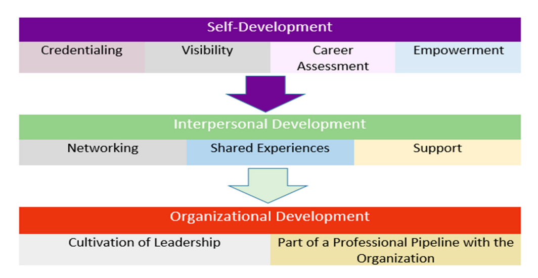
Figure 2. First Attempt at Defining Women's Leadership Levels and Themes.

Initially, our findings at these three levels were indicated by the themes in Figure 2. At the personal level, credentialing, visibility, career assessment and empowerment emerged as themes. At the interpersonal level, networking, shared experience, and support were significant. At the organizational level, cultivation for leadership and being a part of the professional pipeline were central. At that early point in our analysis, we agreed that our professional development was positively impacted by our participation in the WLP program, and that the program was successful in its goal of creating a leadership development opportunity for women at the institution. However, looking back, at this initial stage of our research process, we were in a very guarded, superficial space—both with ourselves and each other.