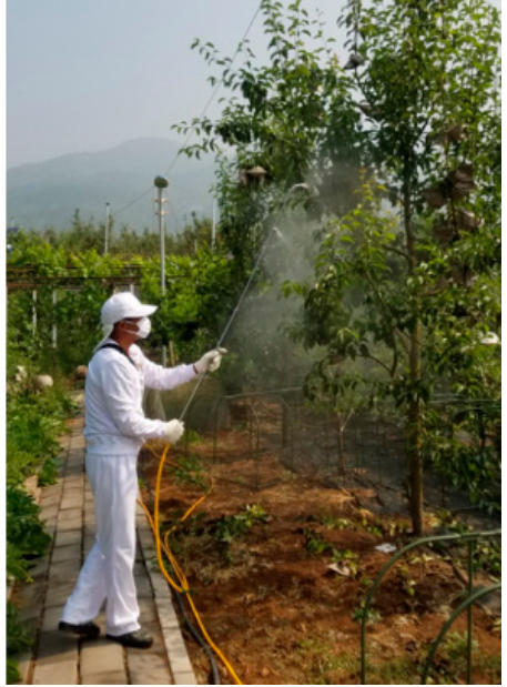
Figure 1. Stretcher-type power sprayer.