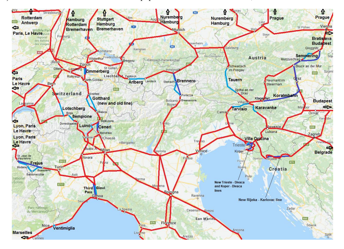
Figure 2. Alpine passes taken into account in this study. Alpine railway lines currently in operation ('current scenario') are represented in light blue; Alpine railway lines under construction or planned ('project scenario') are represented in dark blue.