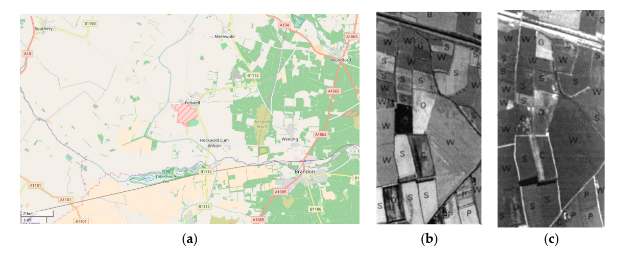
Figure 2. Data for Feltwell. (a) The location of Feltwell, © OpenStreetMap contributors; (b) airborne thematic mapper (ATM) image extract in waveband 4 and (c) ATM image extract in waveband 7.