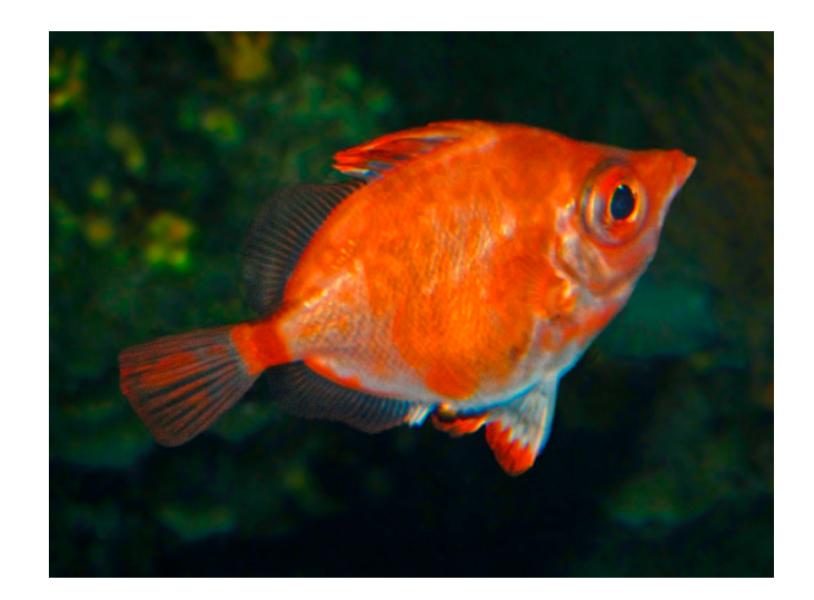
Figure 1. Boarfish (Capros aper) [9].