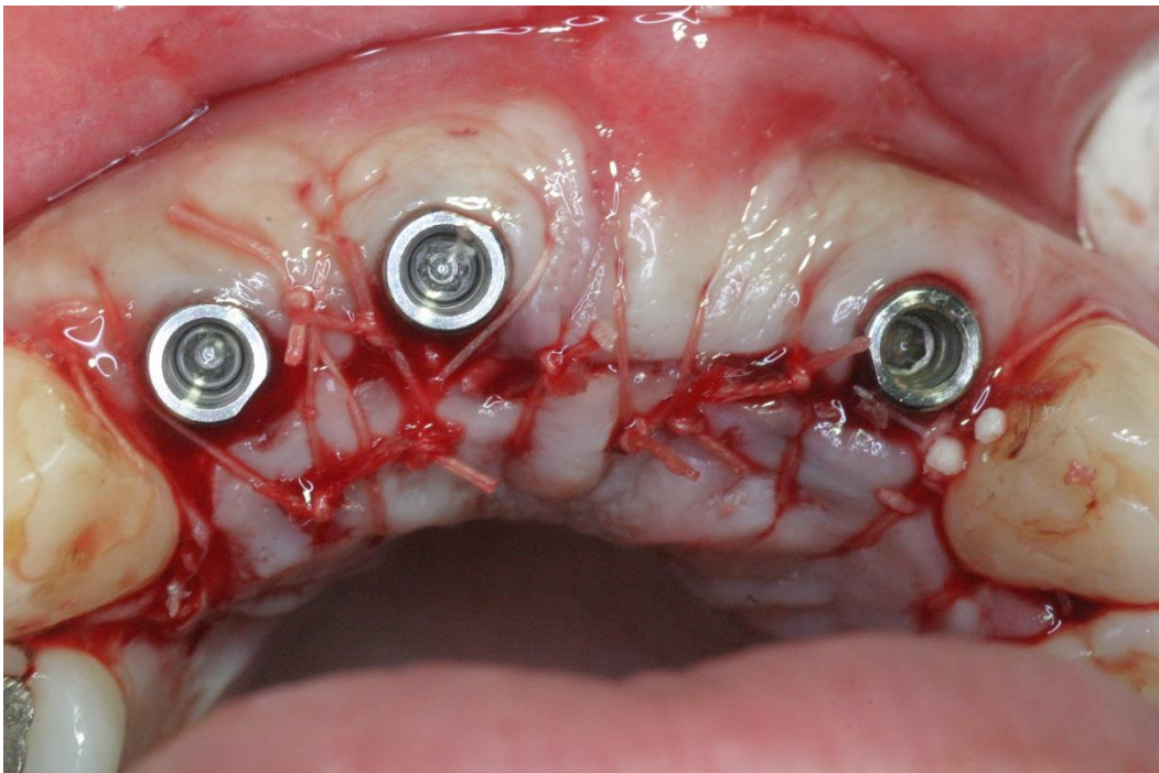
Figure S4 A coronally positioned flap was performed after a periosteal releasing incision.