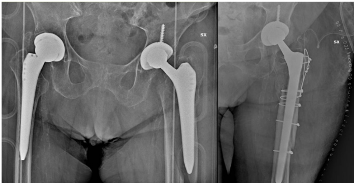
Figure 1. Periprosthetic fracture with unstable stem (Alloclassic), which underwent revision surgery.

We retrospectively reviewed the periprosthetic fractures of the proximal femur which occurred in the period between 2010 and 2023 and were surgically treated at SS Annunziata Hospital, Savigliano, Italy. Among them, we focused on periprosthetic fractures involving CLS ® or Alloclassic ® Zimmer (Woso, IN, USA) uncemented femoral stems. Patients were therefore divided into two distinct groups: Group A, comprising individuals with PFFs who previously underwent uncemented primary hip replacement with the Zweymuller Alloclassic ® stems (Zimmer), and Group B, consisting of patients with PFFs on a Spotorno CLS ® stem (Zimmer) [Figures 1 and 2].