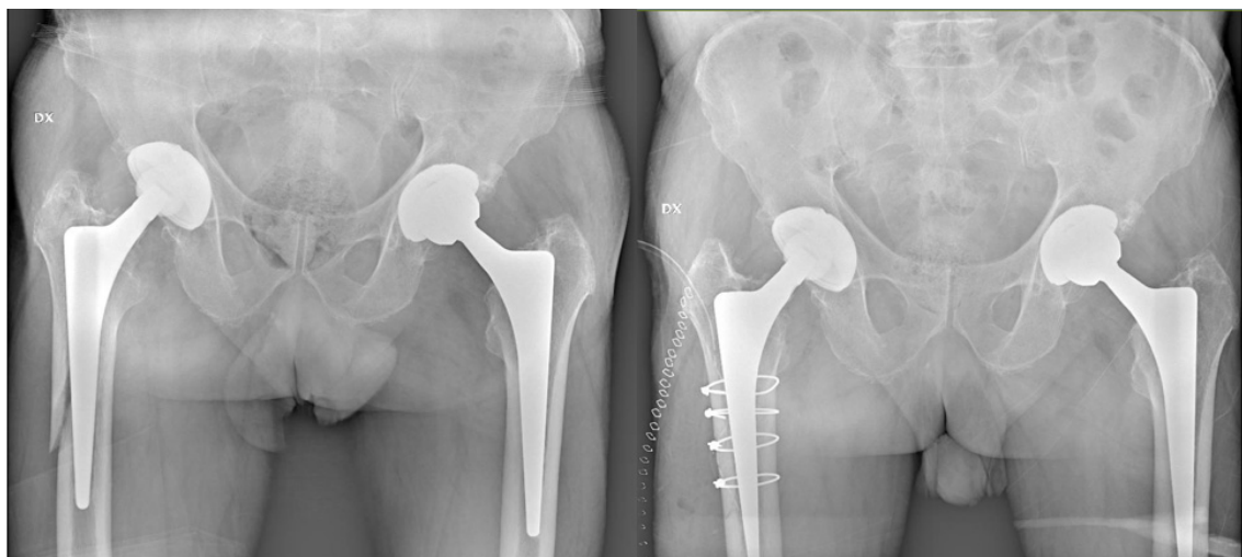
Figure 2. Periprosthetic fracture with stable stem (CLS), which underwent osteosynthesis surgery.

osteosynthesis and pathological fractures. We only selected patients who underwent a complete preoperative radiological study, including an antero-posterior (AP) and axial X-ray of the pelvis and hip as standardized in our institution; for the most complex cases where stem loosening was uncertain, a preoperative CT study was also performed.