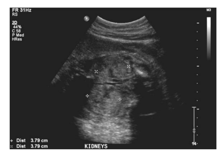
Figure 1. Ultrasound image of fetal kidneys at 27 weeks of gestation.