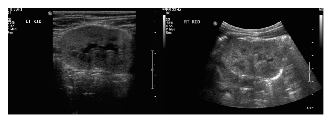
Figure 3. Ultrasound images of baby's left and right kidney at 6 weeks of age.

Serum for suPAR and the activation of its receptor integrin alphavbeta3 (AP5 activation) were assessed by established methods [11]. The measurement of serum suPAR was performed using a Human uPAR Quantikine ELISA kit (R&D Systems Inc., Minneapolis, MN, USA) following the manufacturer's instructions. To semiquantitatively examine the effect of FSGS patient sera on podocyte \beta 3 integrin activity, a human podocyte cell line (provided by Dr. Moin Salem, Bristol, UK) was cultured at 37 °C for 14 days for complete differentiation. Maternal serum demonstrated increased AP5 activation, while both elevated suPAR levels and AP5 activation were noted in the cord blood (Table 1), suggesting transplacental transmission of permeability factors that resulted in bilateral echogenic fetal kidneys, decreased fetal urine output, and, therefore, severe oligohydramnios.