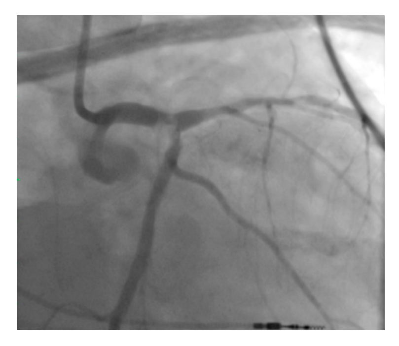
Figure 1. Pre-Intervention Coronary Angiogram. There is evidence of a calcific 80% distal left main coronary artery lesion that extends to the left anterior descending and left circumflex arteries (Medina 1.1.1).

A 79-year-old male presented for an elective coronary angiogram for Canadian Cardiovascular Society Class 3 angina and progressive dyspnea on exertion. Medical history was complex and included atrial fibrillation, insulin dependent diabetes, dual chamber pacemaker, prostate cancer, moderately differentiated adenocarcinoma of the ascending colon with a recent hemicolectomy, and heart failure with preserved ejection fraction. On coronary angiogram (Figure 1), he was found to have 80% distal LMCA stenosis extending to the left anterior descending (LAD) artery and Circumflex (CFX) artery (Medina 1.1.1), with moderate calcification. The right coronary was chronically occluded; the SYNTAX score was 42. A transthoracic echocardiogram revealed a preserved left ventricular ejection fraction of 55% and moderate aortic stenosis (peak velocity of 2.8 m/s, mean gradient of 18 mmHg, and calculated aortic valve area of 1.0 cm<sup>2</sup>). Cardiac surgery was consulted for coronary artery bypass surgery and aortic valve replacement, but he was deemed high risk for surgery due to a Society of Thoracic Surgery score of 11.6% and a heavily calcified ascending aorta. Following a Heart Team discussion, the decision was made to proceed with UPLM PCI.