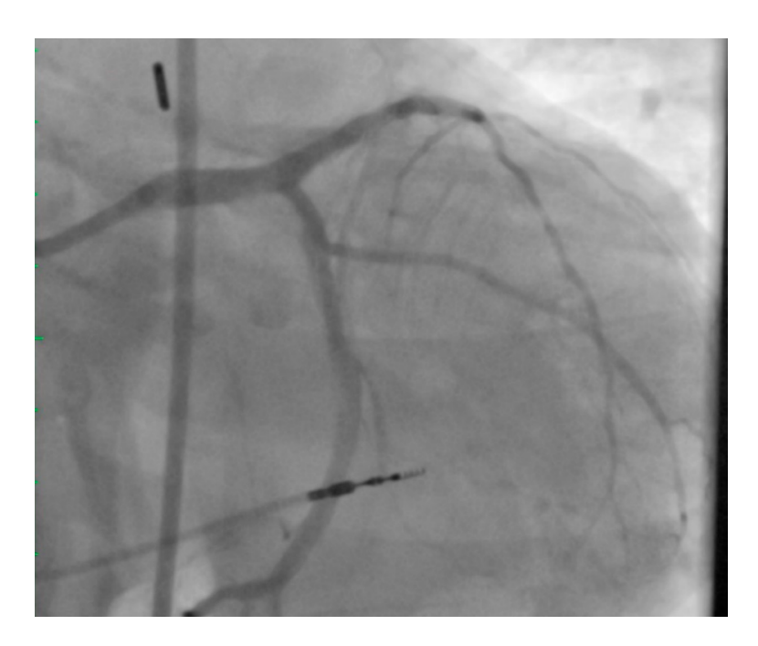
Figure 4. Final Coronary Angiogram. Excellent angiographic result after PCI of the LMCA with a 3.5 \times 15 mm Resolute Onyx DES, post-dilated with a 4.0 mm noncompliant balloon. Additionally, PCI of the ostial CFX was completed using a modified T-stent technique with a 3.0 \times 15 mm Resolute Onyx DES. Final kissing balloon inflations were performed.