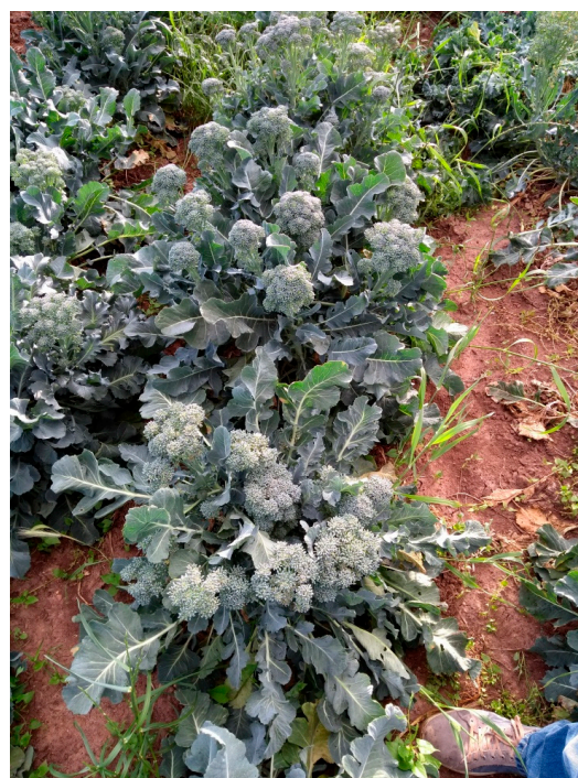
Figure 8. Cultivation of “Mugnolicchio”.