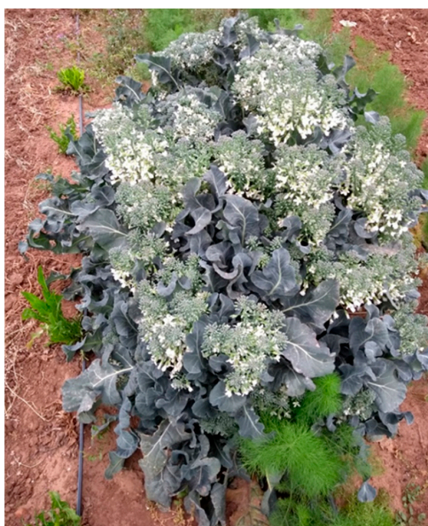
Figure 3. Flowers of “Mugnolicchio”.

“Mugnolicchio” is similar to the broccoli of which, according to recent investigations, it is (probably with “Mugnoli” of Salento—Figure 4), the progenitor from which the latter were selected.