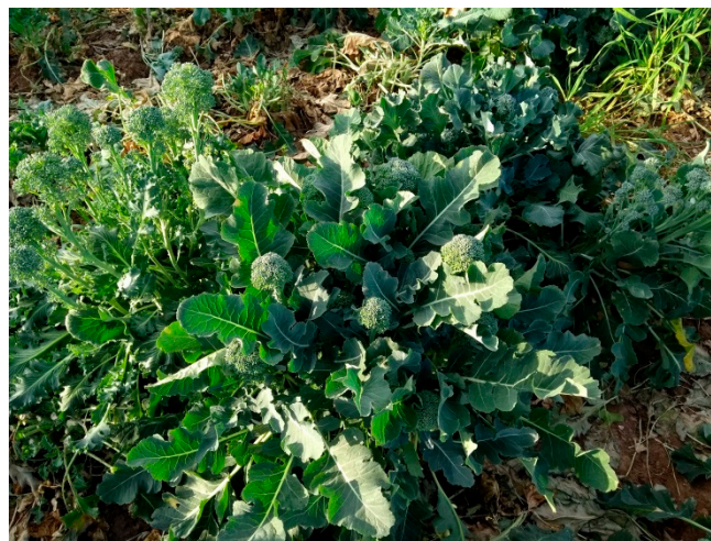
Figure 9. Morphotype with smooth and slightly lobed leaves.

It is still cultivated in small plots of land by some horticulturists. It is sown in August and transplanted in autumn in order to collect the inflorescences from March onwards. The plant can be grown for four years, after that it is replaced. In the past, farmers sowed this crop to separate their own plots from neighboring areas, as a kind of demarcation. Some plants were also sown in April for the exclusive use of the fleshiness of the leaves in summer, cooking them with pasta, mainly when in the middle of summer there are no other cultivated Brassicaceae . There are two morphological types cultivated in the same area. Until now only the morphotype with smooth and slightly lobed leaves is stored in a genebank (i.e., in Bari at IBBR-CNR). One morphotype is characterized by smooth and slightly lobed leaves (Figure 9), the other one by fleshy and very lobed leaves (Figure 10). This last morphotype is probably the typical landrace of the past, because the characteristics of the leaves would make it more appreciated for food.