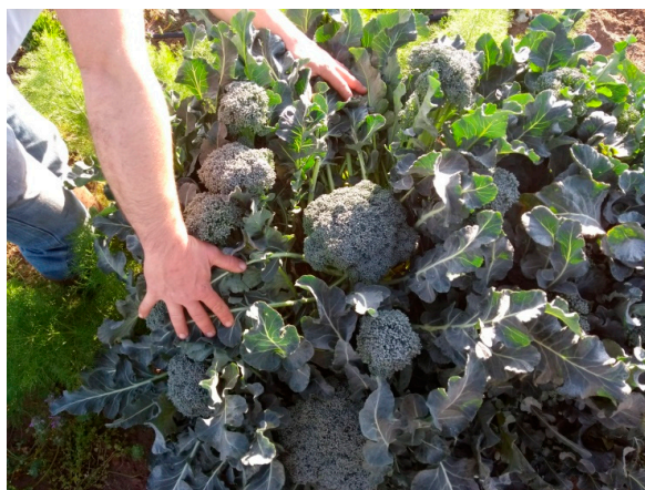
Figure 1. Different big inflorescences of “Mugnolicchio” in the same plant.