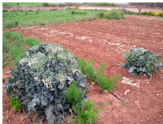
Figure 6. Height difference from “Mugnolicchio”(left) and broccoli (right).