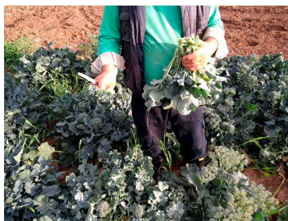
Figure 7. Cultivation of “Mugnolicchio”.