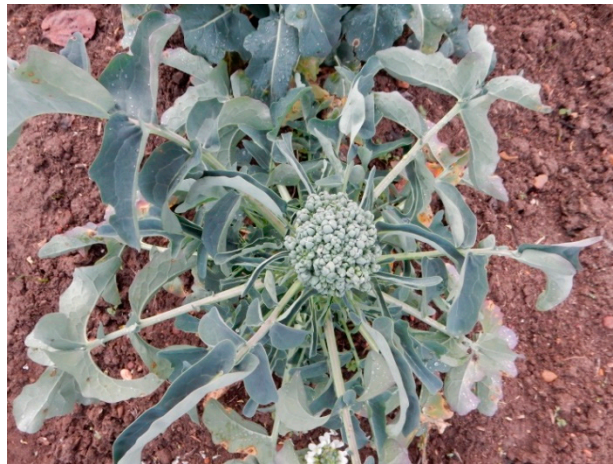
Figure 4. “Mugnoli” of Salento.

However, only a specific genetic study, considering all together its wild and cultivated relatives, will clarify if “Mugnoli” is an ancestor or whether it is a parallel development [20].