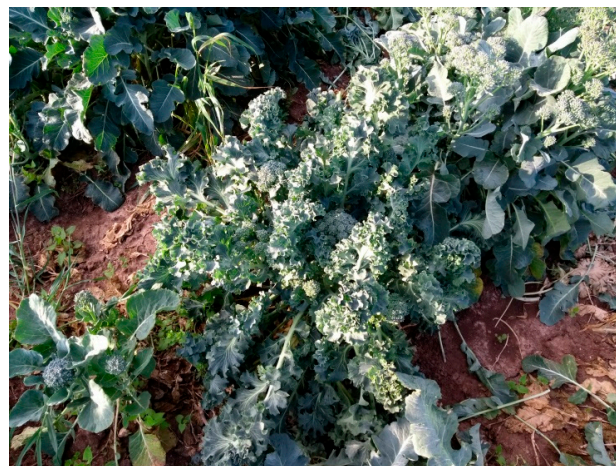
Figure 10. Morphotype with fleshy and very lobed leaves.

The case of “Mugnolicchio” is only one out of a number of other examples of old Italian landraces that are now being broadly cultivated, as the lentil “Lenticchia di Altamura” [21], the common beans “Fagioli di Sarconi” [22] and “Fagiolo poverello bianco di Rotonda” [23], the scarlet eggplant ( Solanum aethiopicum L.) “Melanzana rossa del Pollino” [24], the eggplant “Melanzana Bianca di Senise” [25], the old agroecotypes of potato of the Pollino National Park [26], hulled wheat ( Triticum dicoccon Schrank and T. spelta L.) [26,27], etc.