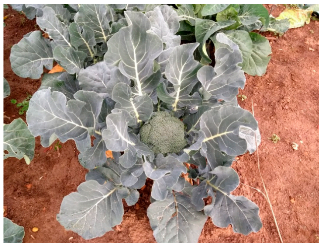
Figure 5. Commercial broccoli variety.

“Mugnolicchio” is a relict landrace because in the area of Altamura (Ba) its cultivation is decreasing (Figures 8 and 9). The standardization of modern cultivars caused a rapid decline of this landrace unable to compete in the market because of its small inflorescences and lack of scalar production. Nowadays it is still produced by small farmers for family use, and very much appreciated by local people.