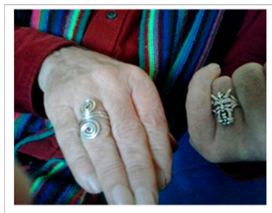
Figure 4. Photograph taken by Jac’s friend of his symbolic jewellery.

They’re called hag stones and to me they relate again to the Goddess. So I think this is why this is important one, a stone with a hole in it. And uh, not all pagans wear them, but quite a lot do. We’re loaded up with symbols, absolutely. We use them a lot (Jac).