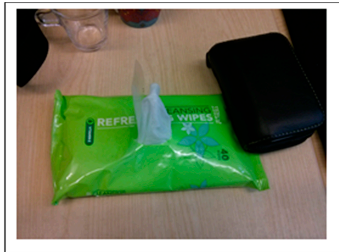
Figure 1. Photograph taken by Zaheem of wet wipes used to ‘wash’ before prayer.

I'm really short so I sort of I need to hold my legs in a dangerous manner and the thing is we need to wash both of our feet so sometimes when I begin with my right foot that's why—but where I put up and my left foot and wash, my right foot is slippery and I might fall a couple of times cos its slippery (Arif).