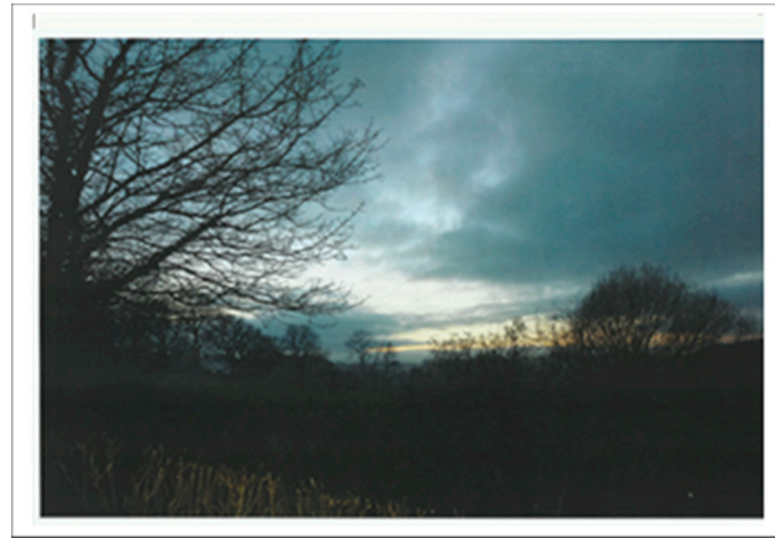
Figure 6. Photograph taken by Beth of the sun breaking through clouds.

But there was something about the light um, and that sort of sense of—I think there’s something about the word awe in nature, you know, that sense of um, the light breaking through the clouds and there’s a sense for me, very often that evokes a sense of God (Beth) (see Figure 6).