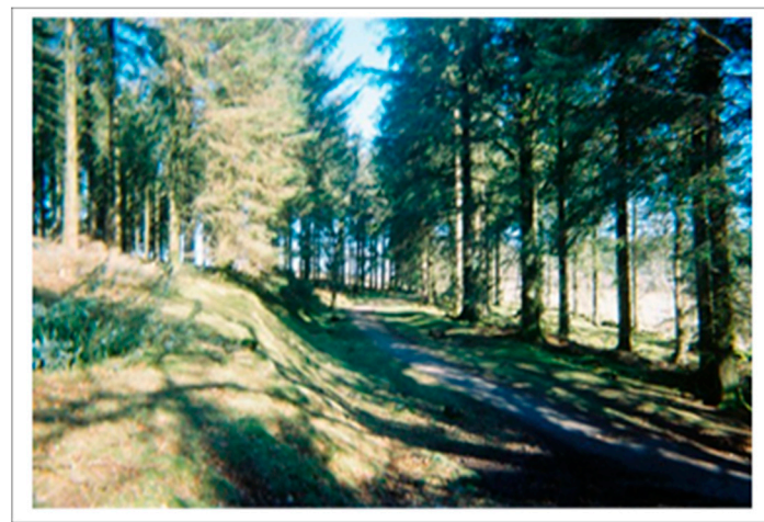
Figure 5. Photograph taken by Jen of her favourite peaceful place.

I think places like this that are peaceful and you can see God’s glory and it’s overlooking, you know, water and hills and everything, um, it is a peaceful place to be with God (Jen) (see Figure 5).