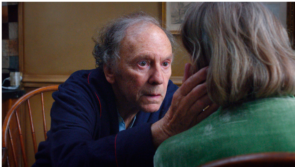
Figure 4. Georges begins to lose touch with Anne.

restrained choices make this meditation on love in the face of death directly philosophical. It is not, however, flatly ethical in the sense we might expect and not principally concerned with Georges's unexpected outburst of violence. Because Georges and Anne are both victims of their mutual suffering, neither can escape what Grundmann calls the "test of their love." [3]. Consider the following moments as standing in defiance of Heidegger's resoluteness and its promise of freedom (see Figure 4).