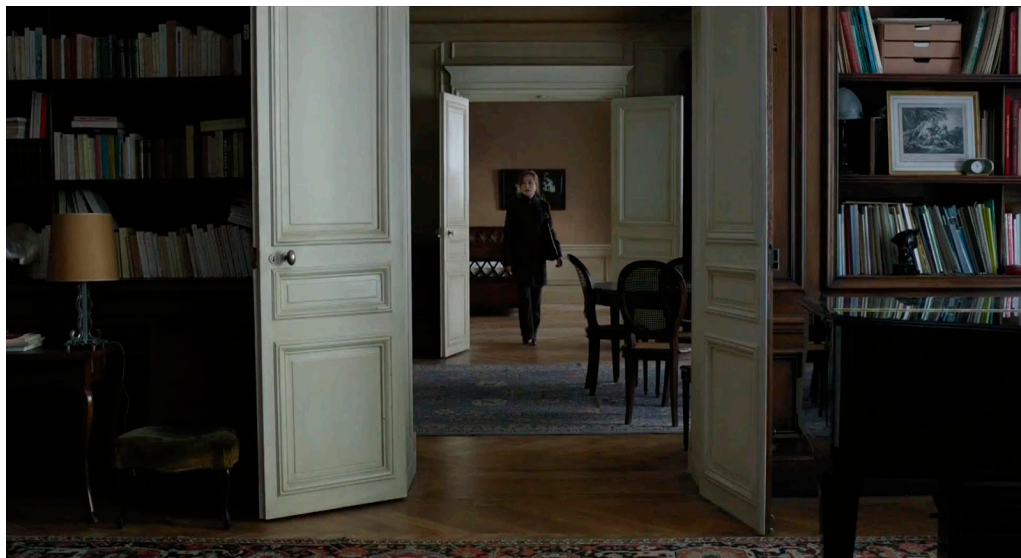
Figure 9. Georges and Anne's daughter visits their empty home.

The theological significance of Michael Haneke's Amour resides in making death real and oppressive for us once more. Haneke does this by thrusting Georges's impossible choice upon us. If we are gripped by the dreadfully paradoxical dictate of love in Amour , then perhaps we will also find in the film an unflinching and equally unshakeable affirmation that the bonds of love that we share in life will—for good or ill, for better or worse—be the same bonds we share in death. Amour stands as a protest to the polite notion that we might ever move on from the loss of our loved ones, especially the loss of a spouse. Thinking our own death cannot be done in isolation from thinking the death of the one we love. For all its austere depictions of the suffering of loss, Amour presents a humane and