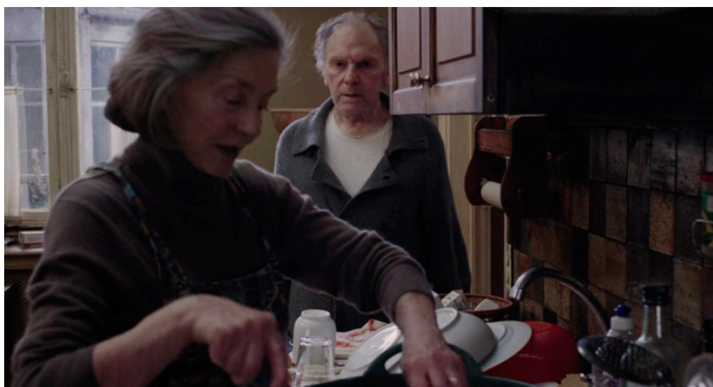
Figure 8. Georges has lost touch.

We must then return to the concluding scenes of the film, but with the recognition that there is so much more that could be said. Let us proceed through the final movements of the film to understand the cost of Georges's horrible choice. With a few subtle narrative choices, Haneke makes clear that the end of Anne means the end of Georges. We begin with the manner of his killing of Anne. It is not beyond the realm of reasonable speculation to see something of his identification with her death in the very manner of his killing. While George smothers Anne, at the same time he plunges his own head into the pillow on top of her face. Could this be taken to indicate the last gesture of intimacy and solidarity with his wife even in her death? Could it be that Georges wishes to die with her even though he cannot? It is not unwarranted to see this impulse to continue in his identification with her in that moment. Perhaps his actions intimate not only murder but also suicide (see Figure 8).