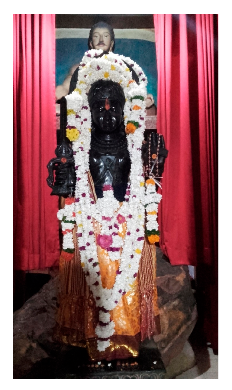
Figure 3. Statue of Ravana in the Sri Lankesvara maha Ravana raja mandiraya . The statue is richly decorated after the annual maha Ravana nanumura mangalyaya . Picture taken by author, 25 March 2018.