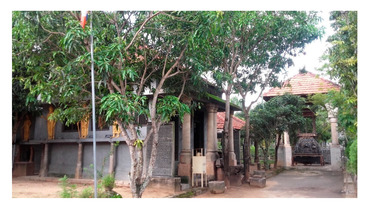
Figure 1. The Sri Lankesvara maha Ravana raja mandiraya (left side). This building is located at the premises of the Sri Devram Maha Viharaya. On the right side: one of the chariots for Ravana. This chariot is taken around in the annual perahera organized by this Buddhist temple. Picture taken by author, 6 June 2017.

The Ravana mandiraya constructed at the Sri Devram Maha Viharaya (see Figure 1) is the second largest building at this section. According to the stone slab which is immured in the front wall, it has been formally inaugurated on the 19 September 2013 by Mahinda Rajapaksa, the president of the previous government of Sri Lanka (2005–2015).