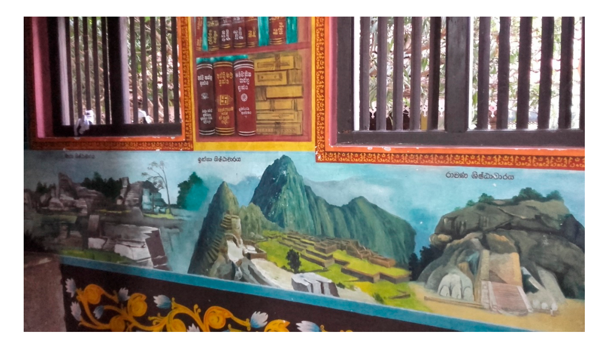
Figure 2. Wall painting in the Ravana mandiraya . This painting shows (from left to right) depictions of the Maya, Inca, and Ravana civilization. The latter is represented by a depiction of the famous Sigirya rock. The painting between the two windows depicts books on medicine. Picture taken by author, 6 June 2017.

advanced civilization: multiple paintings show for instance the ten capabilities of Ravana and one side of the mandiraya contains a painting in which the Ravana civilization is equated with the Maya and Inca civilizations (see Figure 2). In addition to that, the ability of space travelling and the development of aircraft technology is a topic on its own in the wall paintings. Only two depictions of the war-scene (including Rama and his monkey army) show similarities with Hindu-temple paintings. Paintings of the well-known couple Sita and Rama or devotional depictions of Hanuman (the famous monkey devotee of Rama) as known from Hindu temple iconography are absent in the mandiraya .