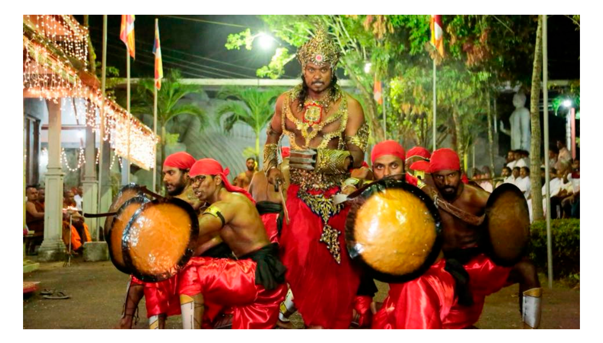
Figure 5. A group of Angampora students and their master performing in the Medin maha Perahera organized by the Sri Devram Maha Viharaya in Pannpipitiya on 24 March 2018. The picture was published on the Facebook Webpage Sri Devram Maha Viharaya (2018a).