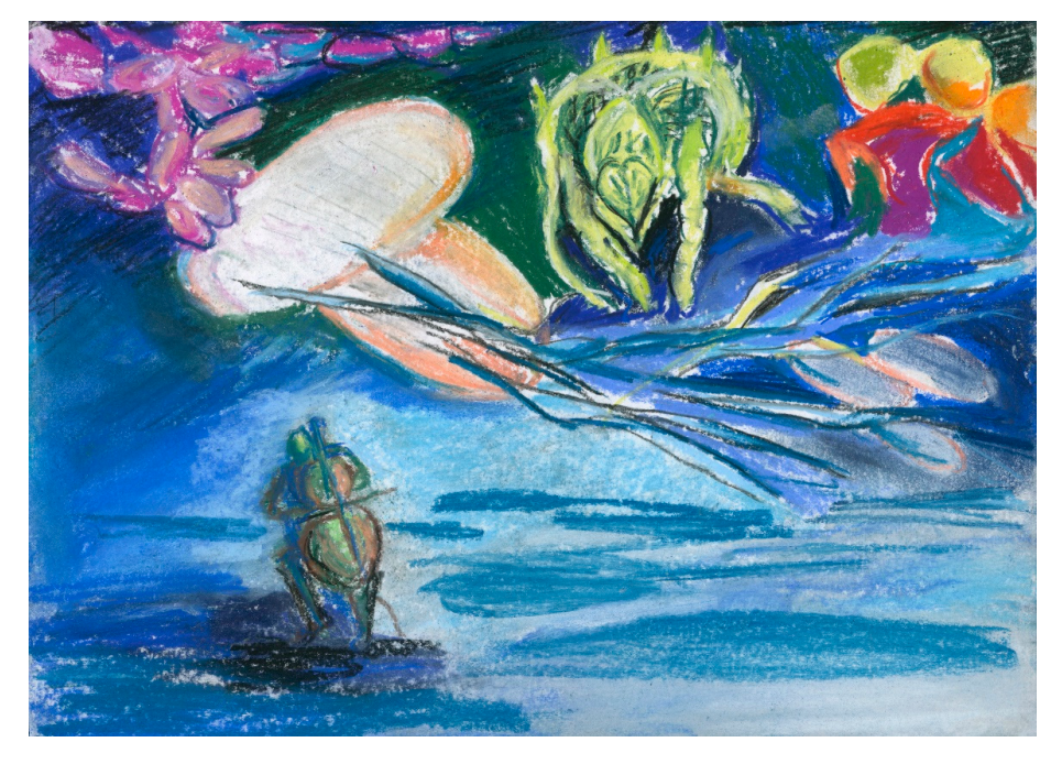
Figure 4. The artwork, 'Humans', sketched by the 'Beeldvormers' for the First European Planetary Health Congress.