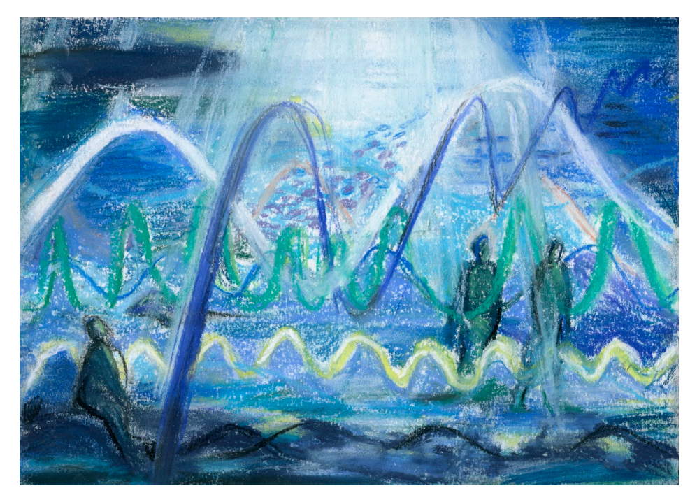
Figure 2. The artwork, 'Theme Water', sketched by the 'Beeldvormers' for the First European Planetary Health Congress.

2.3.1. Listen to the Oceans: They Have Never Been Quiet, but Can Only Persist When They Remain Audible