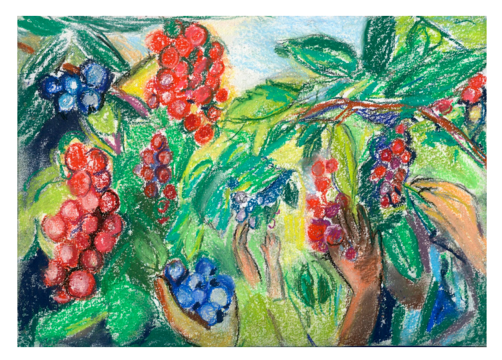
Figure 3. The artwork, 'Food', sketched by the 'Beeldvormers' for the First European Planetary Health Congress.