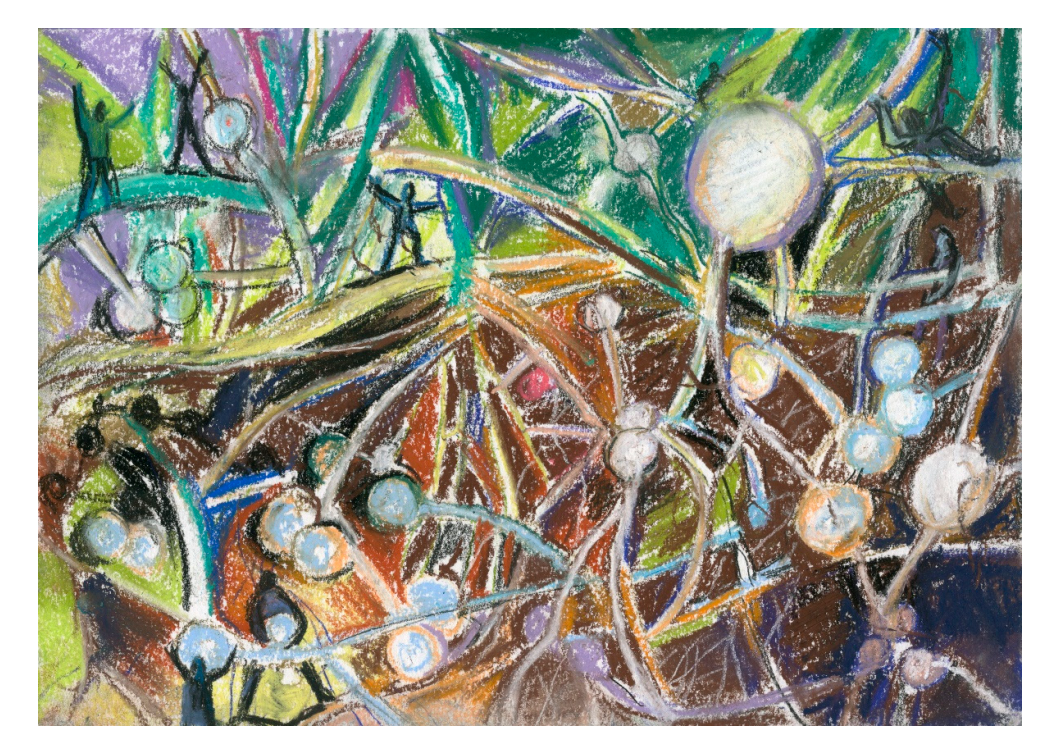
Figure 1. The artwork, 'Theme Earth', sketched by the 'Beeldvormers' for the First European Planetary Health Congress.

2.2.1. Two Sides of the Rewilding Coin: Necessity of Ecological and Human Rewilding