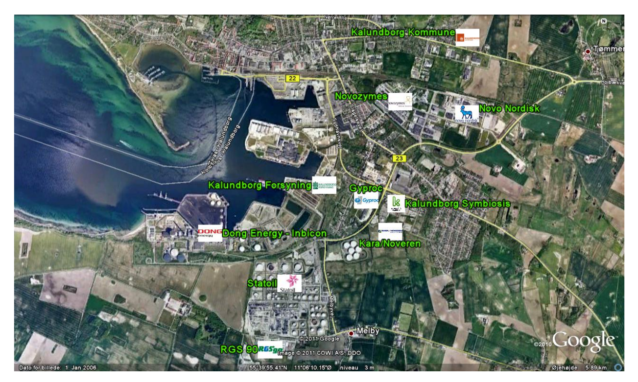
Figure 1. Industrial symbiosis. The Eco-Industrial Park (EIP) at the coastal city of Kalendborg, Denmark. The photo shows the location of the major industries that incorporate the EIP.

Kalundborg is a city of 50,000 inhabitants located on the seashore of the island of Zealand, circa 100 kilometers East of Copenhagen, Denmark (Figure 1). Here we can find the first EIP formally identified as such, later followed by others, e.g., in Styria, the Austrian province where the city of Graz is located (see above), and in the Ruhr region (Germany) [140]. Despite its small population Kalundborg is the largest industrial center on the island with an industrial turnover similar to that of a middle-sized European city, and is still growing. The area includes e.g., two of the world's leading producers of enzyme and insulin (Novo Nordisk), the largest water treatment plant of Northern Europe and the second largest oil refinery of the Baltic Region (Statoil). On the other hand, due to the heavy-industry located here, there are, among others, pollution problems to be solved, e.g., the production of green-house gas (GHG) emissions: Kalundborg is responsible alone for circa 9% of the total Danish CO<sub>2</sub> emission. However, and according to the municipality, Kalundborg is striving to become a green industrial municipality by 2020; its policy is to make compatible its continued growth with the protection of the environment [141].