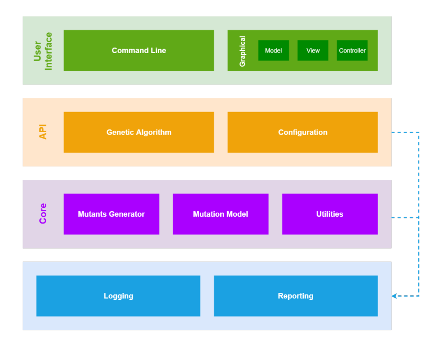
Figure 7. GaSubtle architecture.

GaSubtle is built by using a layered architecture pattern in order to support portability. The layers of GaSubtle are shown in figure in Figure 7. In the following sections, we describe each of the tool layers.