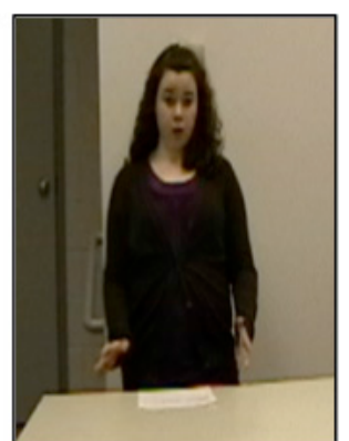
"It [large piece of canvas] can be used to make tents (metaphoric gesture)..."