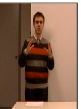
Figure 3. Screenshots of the four gesture types.

production. Movements coded as co-speech gestures for purpose of the present analysis included two categories of gesture. The first category was "representational gesture" and included deictic gestures (points), iconic gestures (depicting concrete images or actions), metaphoric gestures (imagistically adding concreteness to the abstract). The second category was beat gesture, which are short, bi-phasic movements serving the purpose of emphasis and marking discourse structure (McNeill, 2005). See Figure 3 for screenshots of each gesture type. Other movements such as self- or object-adapters (those often associated with nervousness such as wringing one's hands, hair-twirling and self-grooming) were not counted as relevant gestures.