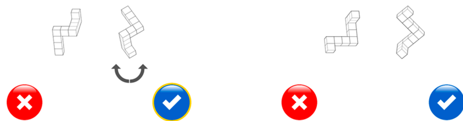
Figure 3. Examples of practice trials (left) and test trials (right) of the Shepard and Metzler cube rotation task.

After selecting a response button, children were invited to check the response by rotating the figure on the righthand side using the arrows (see Figure 3, left). Next, 6 practice trials (3 same) were presented with figures at angular discrepancies of 30^\circ , 60^\circ , 150^\circ , 240^\circ , 210^\circ , and 300^\circ . Practice trials were followed immediately by four test blocks that comprised 8 trials each (4 same), at angular discrepancies of 0^\circ to 315^\circ , in steps of 45^\circ (see Figure 3, right). The 32 test trials were presented in quasirandom order per block. Each orientation was presented as a same trial in two blocks, and as a different trial in the other two.