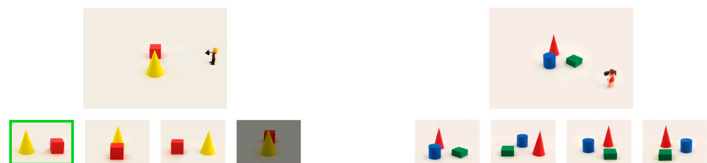
Figure 4. Examples of stimuli from the perspective-taking task: a practice trial, in which Peter is taking a picture of two objects from a 90^\circ perspective (left), and a test trial from block 4, in which Lisa is taking a picture of three objects from a 45^\circ perspective (right).

These three-dimensional practice trials were followed by three practice trials on the touchscreen computer. A scene ( 7.8\text{ cm} \times 11.2\text{ cm} ) was displayed in the upper half of the screen, featuring one figurine taking a picture of two geometric objects (red cube and yellow cylinder). The children were then asked to think about how a photo, taken by the figurine from that position, would look. A choice of four photos ( 3.5\text{ cm} \times 5\text{ cm} ) was presented in the lower half of the screen. As the photos were now on the computer and the children could not walk behind the figurine and peek over its shoulder, they were instructed to pretend doing this in their heads. If the children pressed the incorrect picture, it was dimmed; if they chose the correct picture, it was highlighted with a green frame (see Figure 4, left).