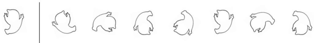
Figure 2. Exemplary test item of the Ghost Rotation paper-pencil task.

For the actual test, children were given two more A4 pages, each containing ten rows of ghost stimuli (see Figure 2 for an example row). Here, the reference ghost on the left had to be compared to seven ghosts on the right, which differed from the orientation of the upright reference figure by 0^\circ to 180^\circ , in steps of 30^\circ . The shapes of the ghosts varied across rows. In total there were 20 different shapes. The children were allotted 2 min to solve each page. Half of the children solved the task in reverse page order, to discourage them from peeking at their neighbors' sheet. A performance score was calculated by subtracting the number of incorrectly circled ghosts and incorrectly crossed-out ghosts from the number of correctly marked ghosts, summed across the two pages. Negative values were therefore possible, as for random responding a score near 0 could be expected. However, only one 6-year-old had a negative score ( -2 ). The highest possible score was 140. Three children had only solved one of the two pages; therefore, regression-based imputation was utilized to estimate performance scores for these children. To that end, using the data of the remaining children, the (total) performance score was regressed on the performance score of the respective page, thus taking into account a possible difference in the difficulty of the two pages.