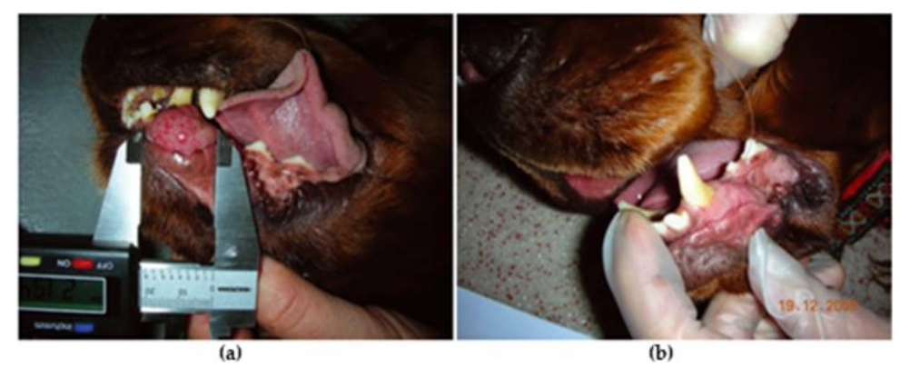
Figure 2. Treatment response of one dog with oral squamous cell carcinoma: (a) immediately prior to treatment; and (b) 21 days after cycle 2 of Paccal Vet treatment. Reproduced from [77].

Another experimental investigation was described by von Euler et al. that demonstrated the better in vivo efficacy of Paccal Vet (100-150 \text{ mg/m}^2) compared with the conventional formulation of paclitaxel (Figure 2) [77].