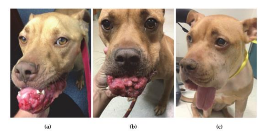
Figure 3. A dog with an inoperable oral squamous cell carcinoma with metastases in regional lymph nodes: (a) before the administration of HylaPlat; (b) after the second injection; (c) at the fourth injection of the formulation. Reproduced by [97].

promoted the localization of cisplatin within the metastatic lymph nodes [98]. The dog reached a complete remission and maintained a stable condition for at least one year after the treatment (Figure 3) [97].