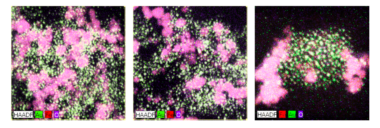
Figure S1: EDX elemental mapping-merged HAADF scanning TEM images of the type 1 NanoIOGs produced at 0.02 wt. % PEI.