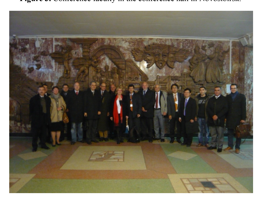
Figure 3. Conference faculty in the conference hall in Novosibirsk.

After Conference memory picture of the faculty was made in the hall of the Congress Center (Figure 3).