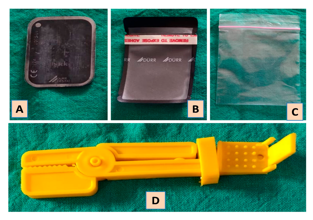
Figure 3. Intra oral radiography films and accessories. ( A ) Phosphor Storage Plates (Sensor); ( B ) Disposable sleeve for the sensor; ( C ) Outer (double barrier) transparent disposable sleeve for the sensor; ( D ) Eezee Grip/Snap A Ray Film holder for intra oral radiography.

Figure 2. This figure depicts a patient's lateral ( A ) and front ( B ) profile while being prepared for cone beam computed tomography (CBCT) imaging. Here, patient is shown wearing the face mask as a part of "new" infection control protocol. The red colour positioning lights can be seen assisting in the positioning of patient in the correct Sagittal and coronal plane.