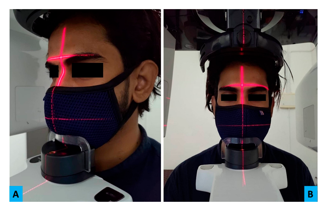
Figure 2. This figure depicts a patient's lateral ( A ) and front ( B ) profile while being prepared for cone beam computed tomography (CBCT) imaging. Here, patient is shown wearing the face mask as a part of "new" infection control protocol. The red colour positioning lights can be seen assisting in the positioning of patient in the correct Sagittal and coronal plane.