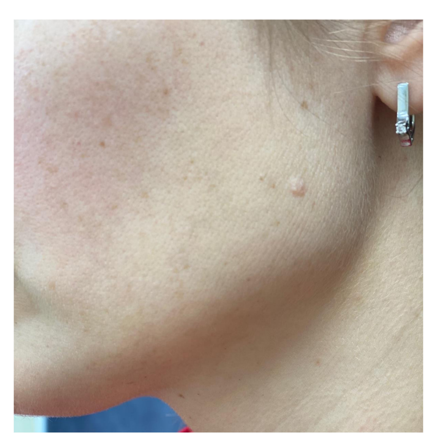
Figure 5. The scar after removal of a neoplasm on the skin of the face after 10 years.