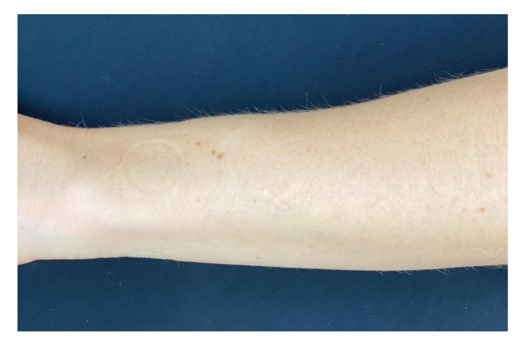
Figure 3. Normotrophic scar after four procedures (after nine months) on the arm.