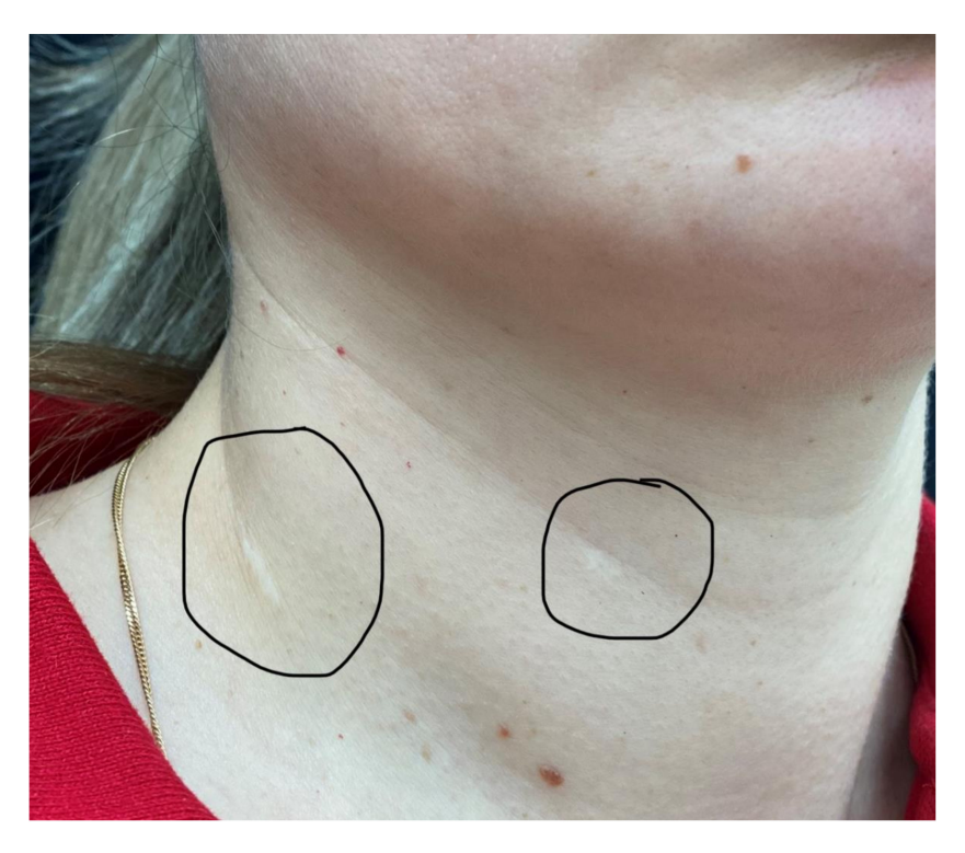
Figure 6. The scar after removal of a neoplasm on the skin of the neck after 12 years (at the lateral side) and the scar after removal of a neoplasm on the skin of the neck after five years (at the central side).