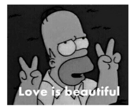
(a) Common: grey, rolling eyes, open mouth, the Simpsons Text: found donut photo (not mine).. enjoy

Figure 3 displays sample tweets that our model accurately detects as sarcastic. The experimental results demonstrate that sentiment word embeddings facilitate precise sarcasm detection. For instance, in Figure 3a, the text "find the donut photo (not mine) . . . enjoy" contrasts with the "sad grey expression" in the accompanying image. The sentimental feature attention mechanism prioritizes the word "enjoy" in the text, which is the critical element in the image common, alongside detecting the gesture "rolling eyes". Consequently, our model can identify the tweet as sarcastic. Similarly, for the sarcasm detection in Figure 3b, the text ""i'm 6 ' 3" . . . "great" legroom in # united economy . . . " contrasts with the "confined space" in the accompanying image. With the help of sentiment vectors, our model learns the inconsistent dependencies of the two modalities and predicts the correct outcome for these examples.