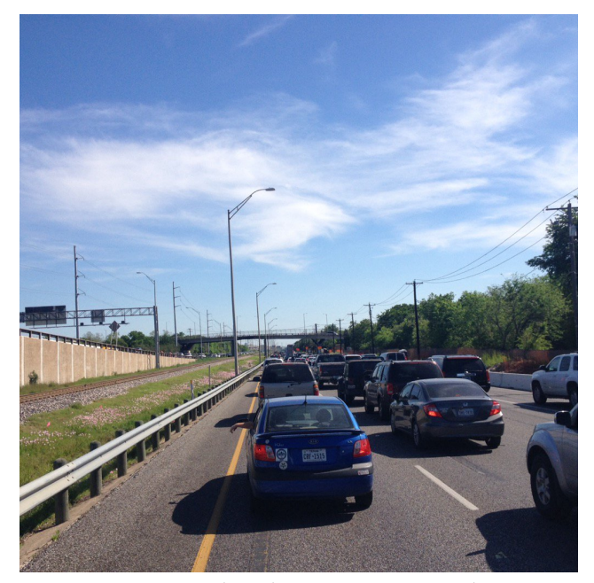
Text: 158 new people a day in # austin # welcome.

architecture using the RoBERTa model that adds a common attention layer on top to merge context inconsistencies between input text and image properties. Similarly, Yao et al. [4] developed a multi-modal, multi-interaction, and multi-level neural network using genetic algorithms to extract modality information multiple times to obtain multi-perspective information [5]. Liang et al. [6] proposed a method for determining inconsistency across different modalities by constructing heterogeneous modality graphs and cross-modal graphs for each multi-modal example.