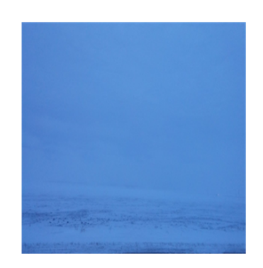
(b) visibility on hwy 8 is awesome ! <user>

Figure 4. Sarcastic examples of error analysis.