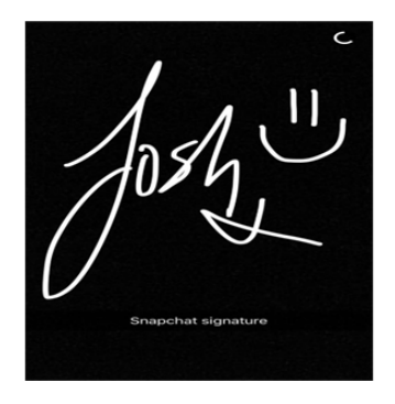
(a) took me so long to get this guys , i waited for hours . thanks <user>