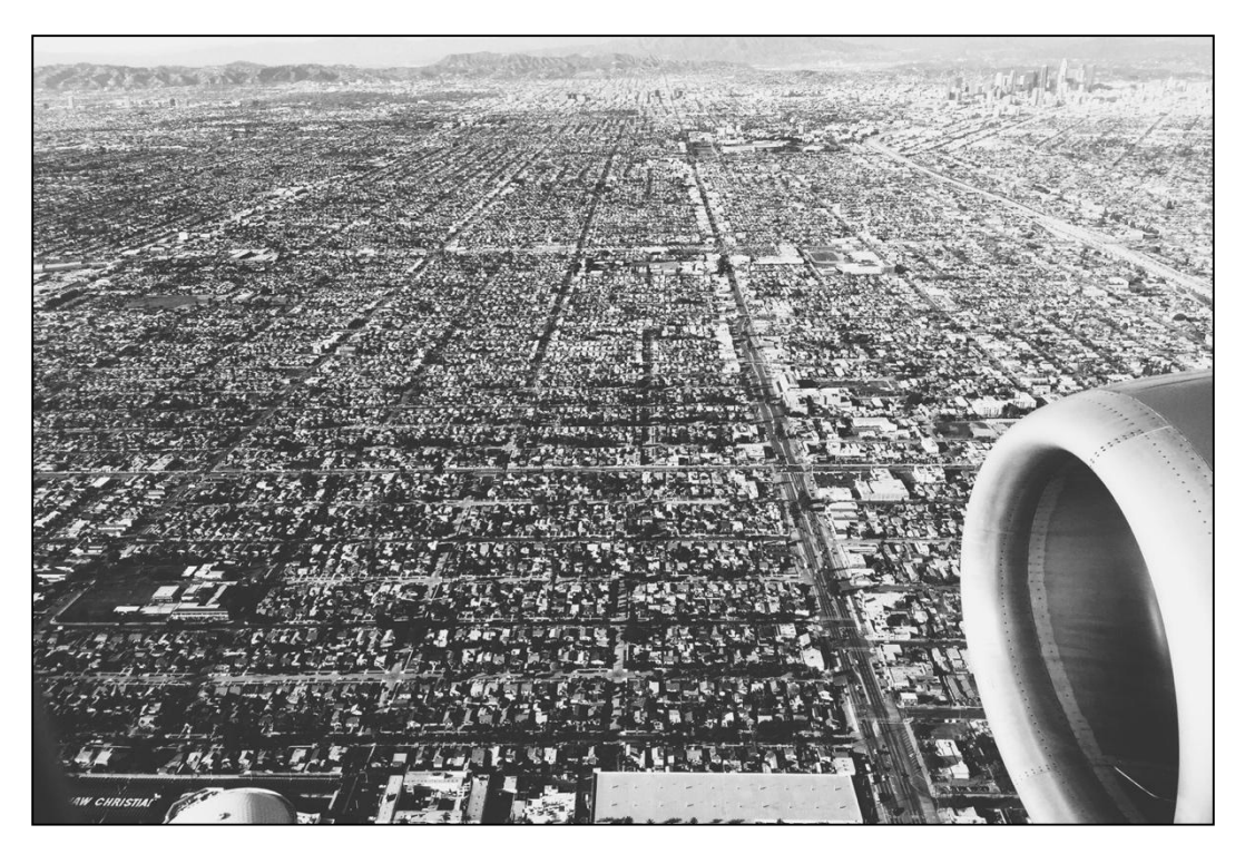
Figure 5. Sprawling development of Los Angeles, 2019.

General Decline of Settlement Densities and Increasing Urban Sprawl: AVs have the natural potential to create an induced urban sprawl—in other words, growth of low-density suburbs (Figure 5). AVs could trigger travel demand (necessary or not) particularly in high motor vehicle dependent societies [69]. They can result in more dispersed and fragmented land uses in the outskirts of cities [70]. This can occur when travel that is more effortless is seen as less of a burden and an invitation to travel more—unless legislators and planners act now. Optimization of accessibility of communities through better land use provision or allocation is required to discourage sprawl.