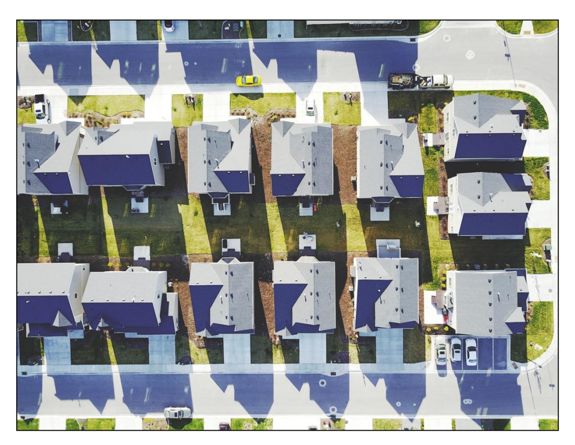
Figure 6. Greenfield development, 2019.

The Environmental Impact of the Use of AVs: The intrinsic technical attributes of AVs appear to be largely favorable in the literature [72]. Moving away from fossil fuel-based energy in electric AVs (given energy is generated from solar, wind or so on) is a positive step to lower the environmental undesired externalities. This is particularly true for AVs' potential for increasing ride-sharing and thus shift personal transportation from individually owned vehicles toward shared-use mobility services [73]. However, increased efficiency and effectiveness of the transport system, as a result of advanced autonomous driving technology, may lead to increased travel speeds and hence increasing greenhouse gas (GHG) emissions [74]. In other words, as stated by Miller and Heard [75], "[i]t is plausible that AVs could become more efficient and GHG emissions could decrease on a functional unit basis (i.e., per-passenger-mile), while overall transport-related GHG emissions increase as vehicle miles traveled (VMT) increase" (p. 6119). Increased mobility and travel convenience could lead to urban sprawl and a rapid expansion of the urban footprint—that is a contributor to the changing climate [76]. Besides the environmental harm of greenfield developments—converting green or agricultural land into urban land uses (Figure 6)—it induces additional GHG emissions due to long travel distance.