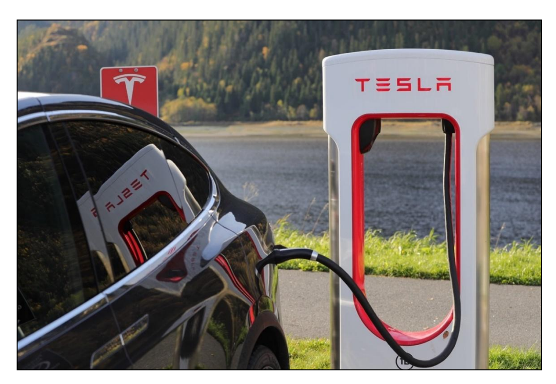
Figure 3. An electric autonomous vehicle charging, 2019.

AVs include automobiles, trucks, drones, ferries, and ships that are driverless or self-driving. Autonomous mobility has evolved incrementally over decades employing many different technologies for steering, navigation, collision avoidance, and maneuvering that will culminate in fully autonomous systems in the next few years. Some elements of AVs have been in use for many years while others are just entering the market. A further implication of the introduction of AVs depends on the power source used, with many AVs being electric (Figure 3) rather than gasoline/diesel, so a shift to AVs may also herald a shift in vehicle energy sources [44]. When summed, however, the set of technologies offers the potential for a vehicle to move and navigate through traffic with no driver assistance.