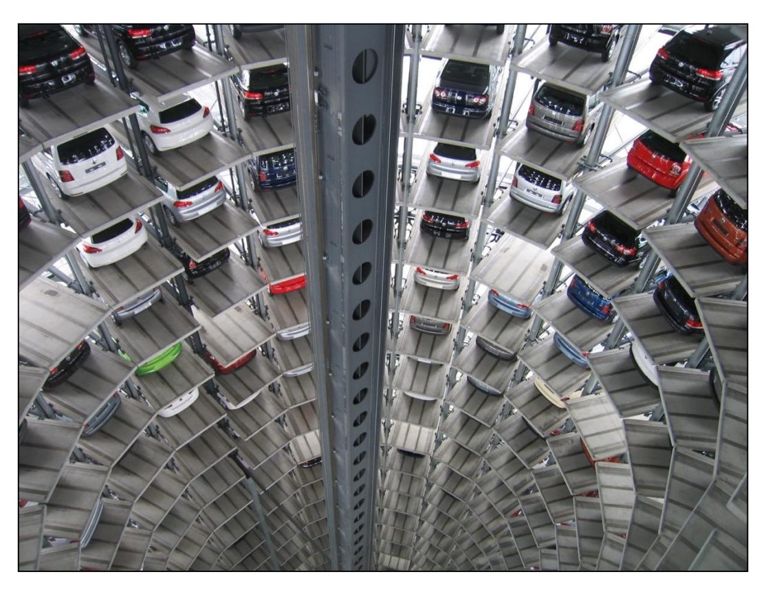
Figure 4. An exemplar parking space complex for autonomous vehicles, 2019.

(or in activity centers) and declines away from these destinations. Hence, it is most likely that parking facilities will be outside the urban core in distributed locations, and they will include daytime or overnight charging facilities at the parking lots. Depending on the location and business models, some of these parking facilities might be in the form of the multi-level parking as in Figure 4. As a result, the requirements to provide obligatory parking spaces in these high-value property areas will need a re-estimation [60]. Reduction in parking lots will transform inner-city areas, as unoccupied parking space will be used for other activities—such as parks or affordable housing. This transformation will allow further realization of mixed-use precincts to trigger the trend of downtown living, creating inner-city areas that are more functional and livable. Meanwhile, some AV charging lots in and out of the city might also be used as mobile office locations. On the other hand, there also exists a pessimistic perspective. Highlighted in a review by Stead and Vaddadi [57], "parking policies will remain as they are (i.e., AVs will use on-road parking spaces). A growth in AV ownership and use leads to an increase in demand for parking spaces in the city. Large numbers of collection/drop-off points are created in the city which add to the amount of space allocated for vehicles" (p. 126).