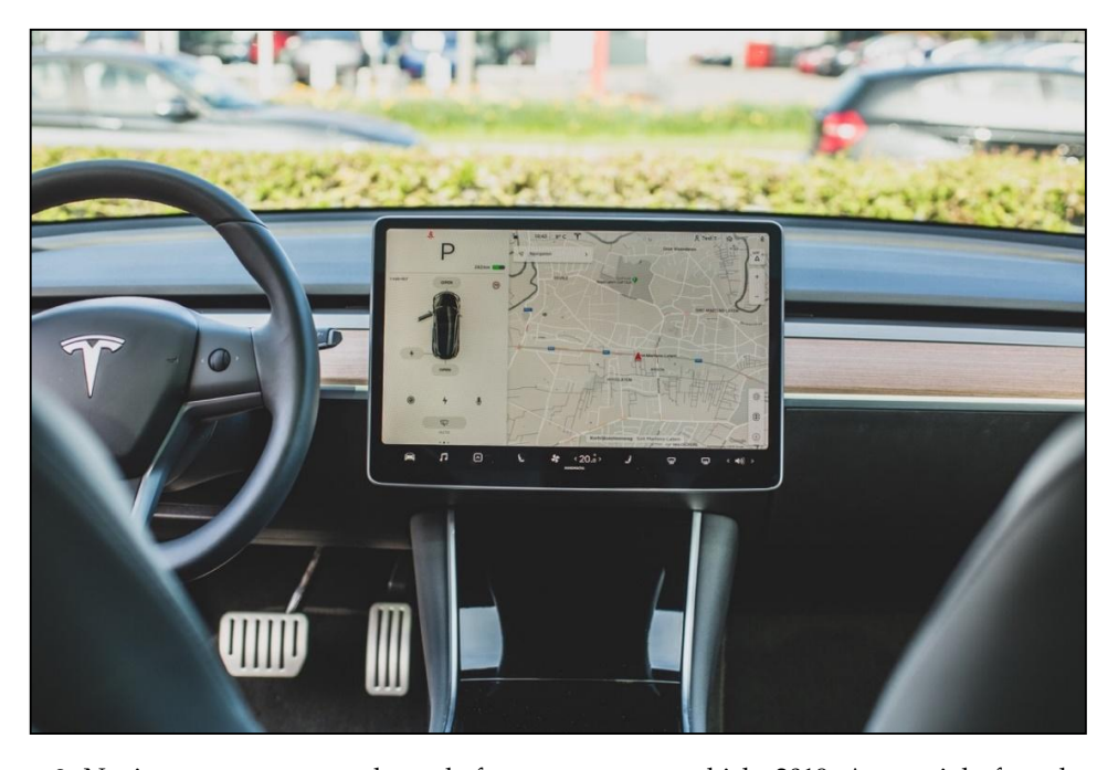
Figure 2. Navigator system control panel of an autonomous vehicle, 2019.