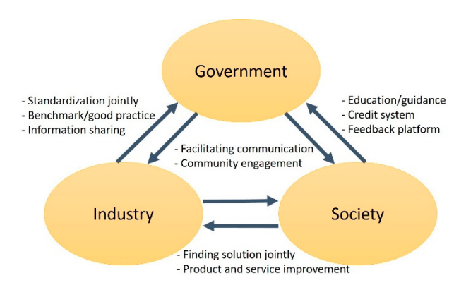
Figure 2. Collaborative governance model.

To generalize the research findings, there are two different forms of government policies. The Hangzhou case represents a gradual movement from the previous hard-law regulation system to collaborative governance. This goes along with the transformation of the public shared bicycle sector towards a combination of public and commercialized shared bike systems. In Nanjing, the original model is self-regulation without interfering from the government. With problems occurring, there is a change from purely self-organization to higher degrees of government control and guidance. The difference reveals that policy and governance approaches should be reconfigured according to the maturity stage of the industry, resource availability, market demand and many other factors.