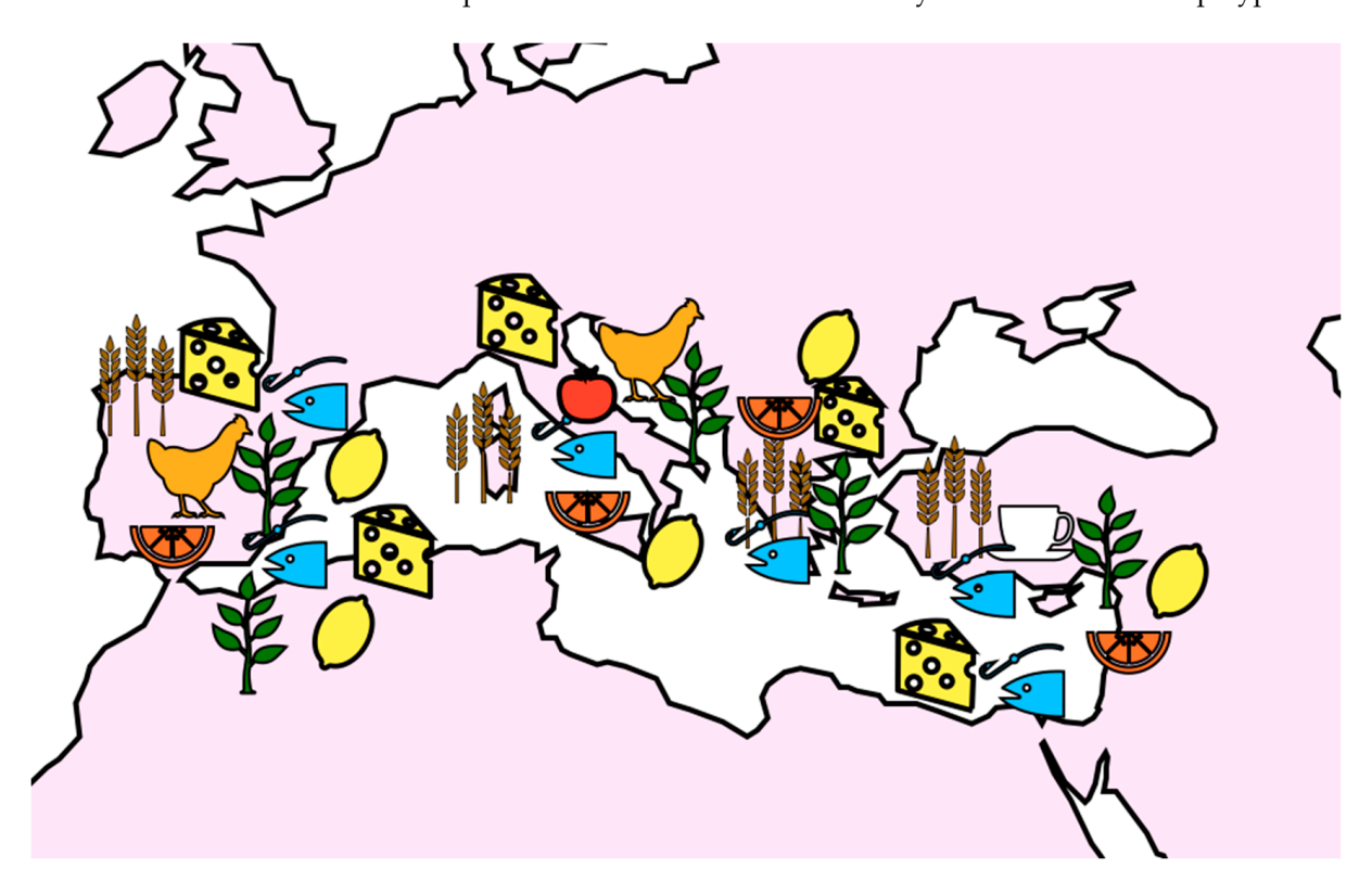
Figure 1. The most consumed foods rich in polyphenols and their distribution in some countries of the Mediterranean area.

The Mediterranean region is a vast area that includes countries such as Spain, Italy, Greece, Turkey, Lebanon, and Morocco as shown in Figure 1. Although the region encompasses a wide variety of cultures and dietary patterns, there are some commonalities in terms of the plant-based foods that are commonly consumed and their polyphenol content.