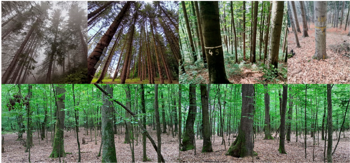
Figure S1 Forest structures typical for Western Carpathians examined in the study, from mountain spruce forests (upper left corner) through mixed beech-fir dominated mountain forests (upper right corner) to sessile oak dominated foothills.