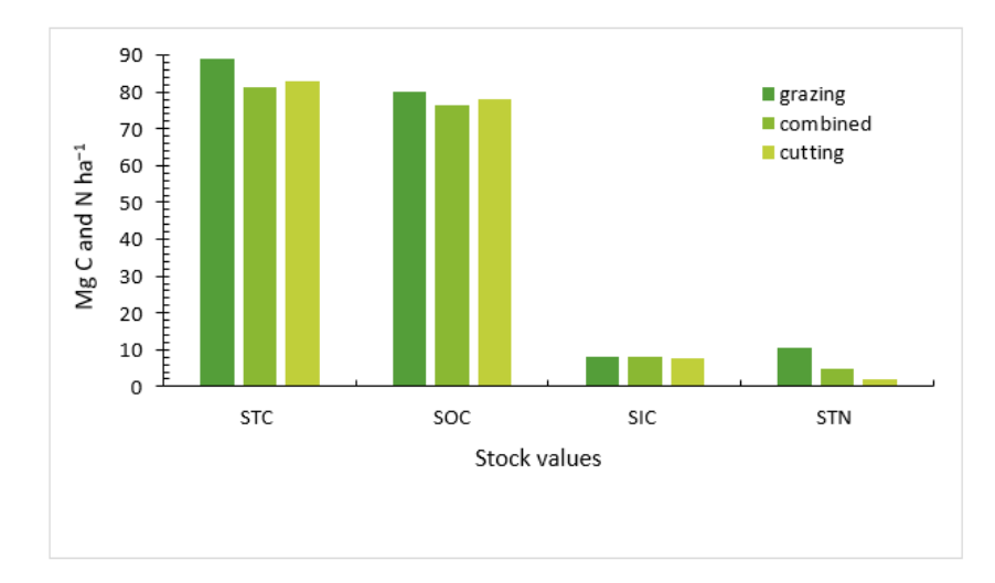
Figure 1. STC<sub>stock</sub>, SOC<sub>stock</sub>, SIC<sub>stock</sub> and STN<sub>stock</sub> in soil under three grassland-management systems (cutting, grazing and combined system) at 30 cm depth. SOC—soil organic carbon; SIC—soil inorganic carbon; STC—soil total carbon; STN—soil total nitrogen.