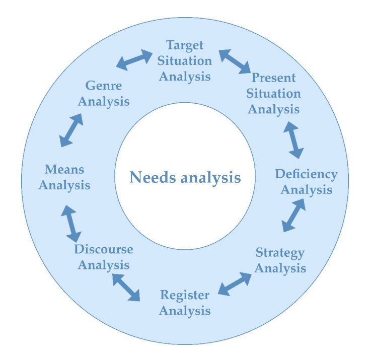
Figure 1. Approaches to needs analysis.

Figure 1 shows the different types of needs analysis. According to Brown [15], a certain combination of these types would be the most reliable way of conducting a needs analysis. Every type of needs analysis concentrates on different aspects that have to be considered during the development of a language course for specialized purposes. These types are: