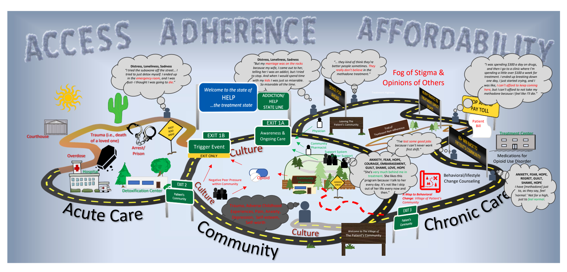
Figure 3. Community-Centered Patient Journey Map in Drug Addiction Treatment.