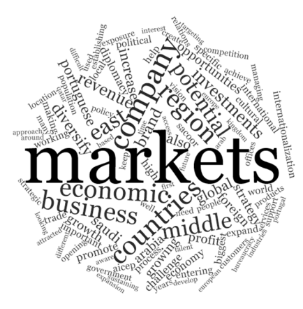
Figure 1. World cloud.

From the focus groups, one main theme, seven categories, and 26 subcategories emerged, representing the perceptions and considerations of economic diplomacy in the internationalization process (Figure 2).