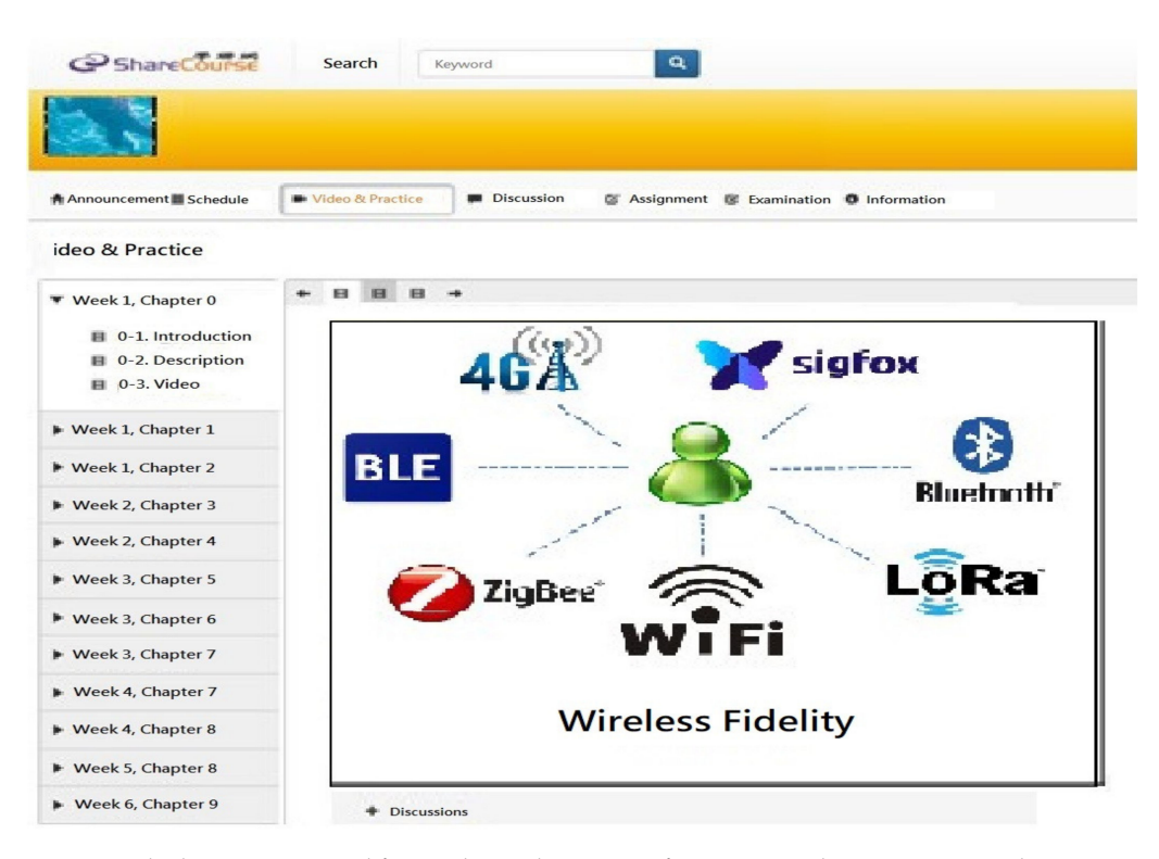
Figure 2. The learning material for week 1 in the course of "Ocean Windows-Oceanographic Museum and Sea World".