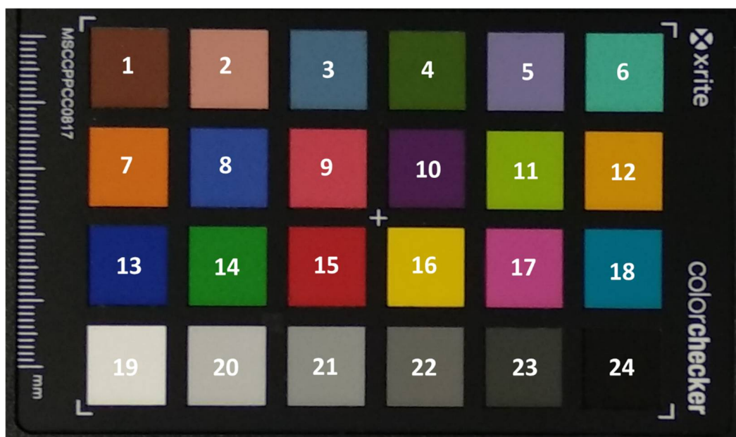
Figure S2. Detail of the color palette with numbers assigned to each patch.