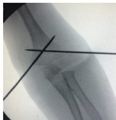
Figure 3. One lateral and one medial pin configuration for supracondylar humeral fracture.