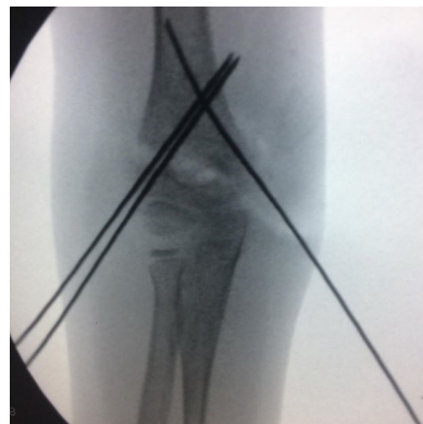
Figure 2. Two lateral and one medial pin configuration for supracondylar humeral fracture.