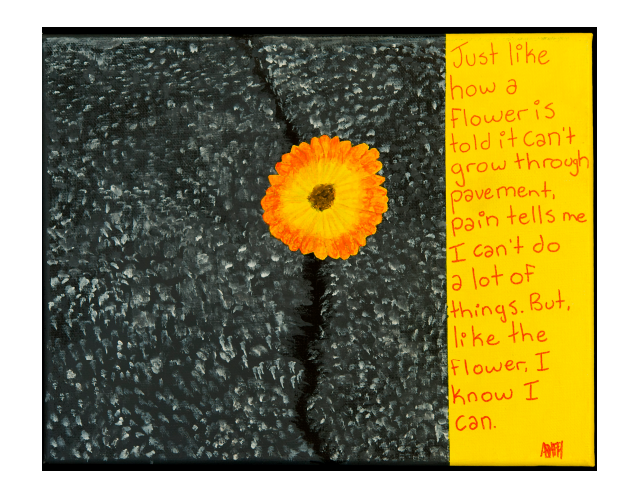
Figure 2. "A flower can grow" created by a Pain 101 participant, A.F.H.